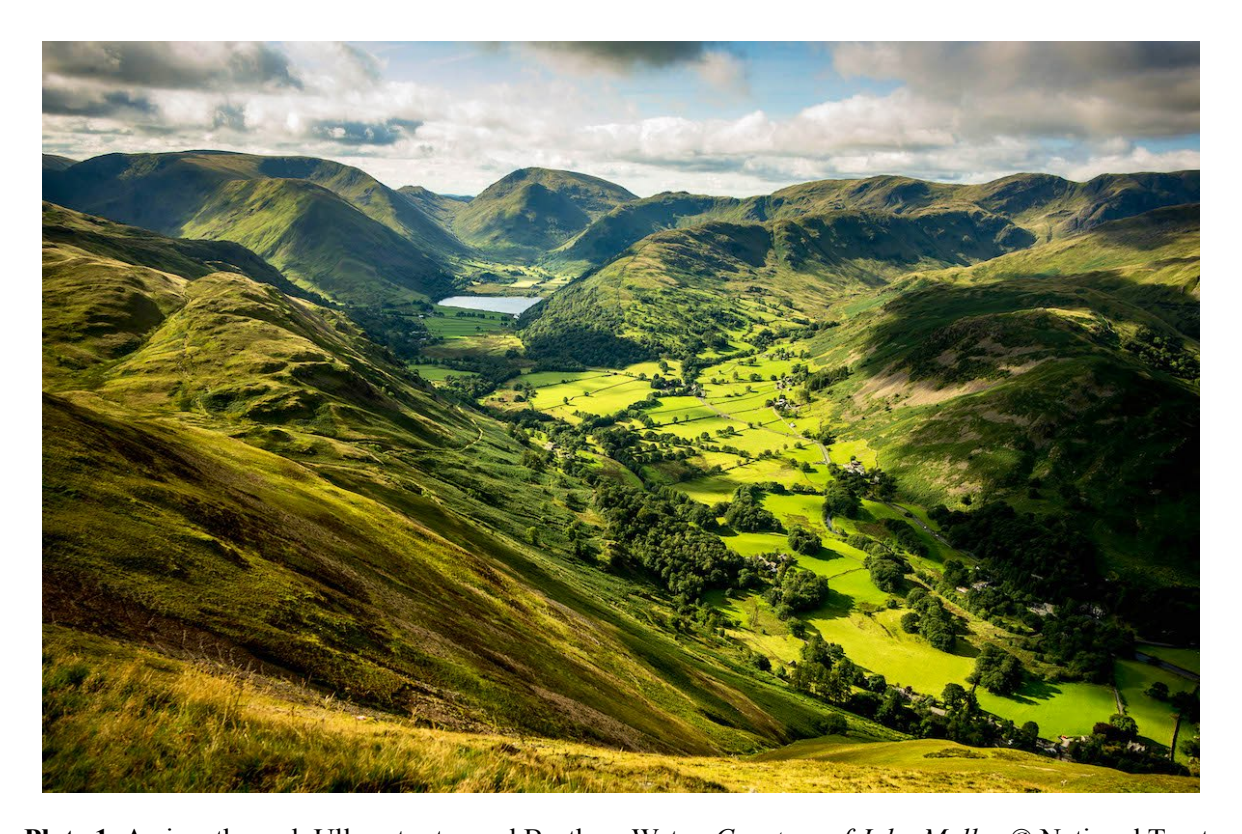
Plate 1. A view through Ullswater toward Brothers Water.

Ullswater, one of the 13 valleys within the Lake District, can be understood to reflect the typical landscape character of the region (see Plate 1). It possesses natural landscape drama in the form of high mountainous fell tops which sweep down to the lakes and rivers on the valley bottom. It also exhibits exceptional scenic beauty as a consequence of the harmonious balance and contrast between different landscape types; meadow, rough grassland, woodland, wood pasture, scrubby ravines and of course, large areas of upland open grazing land.