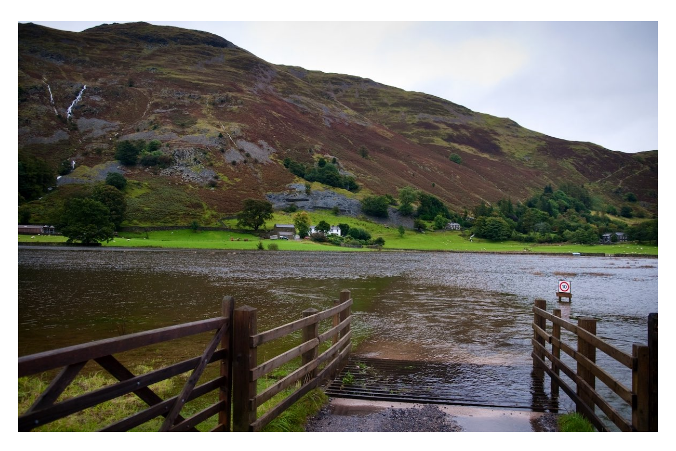
Plate 2. Flood waters occupying the valley bottom in the aftermath of Storm Desmond.

By adopting the Sustainable Land Management approach to understanding the significance of the various natural and cultural assets within the catchment of those flood hit communities, in conjunction with the preparation of a Heritage Impact Assessment in line with the best practice advice from ICOMOS (ICOMOS, 2011) and the Lake District National Park (Lake District National Park, 2018) it has been possible to formulate proposals to safeguard critical infrastructure and increase the flood resilience of communities in the valley. The interventions will also delivers significant benefits for nature by improving the functionality of the river, reconnecting it with its floodplain, and allowing natural process of deposition to occur. There will also be longer-term benefits for the river's ecological health. A rigorous Heritage Impact Assessment process has helped to identify the potential for any landscape interventions to cause significant harm to the attributes of traditional farming culture recognised as part of the Outstanding Universal Value of the English Lake District. By acknowledging that significant harm to attributes of Outstanding Universal Value as at an early stage of the design process, the