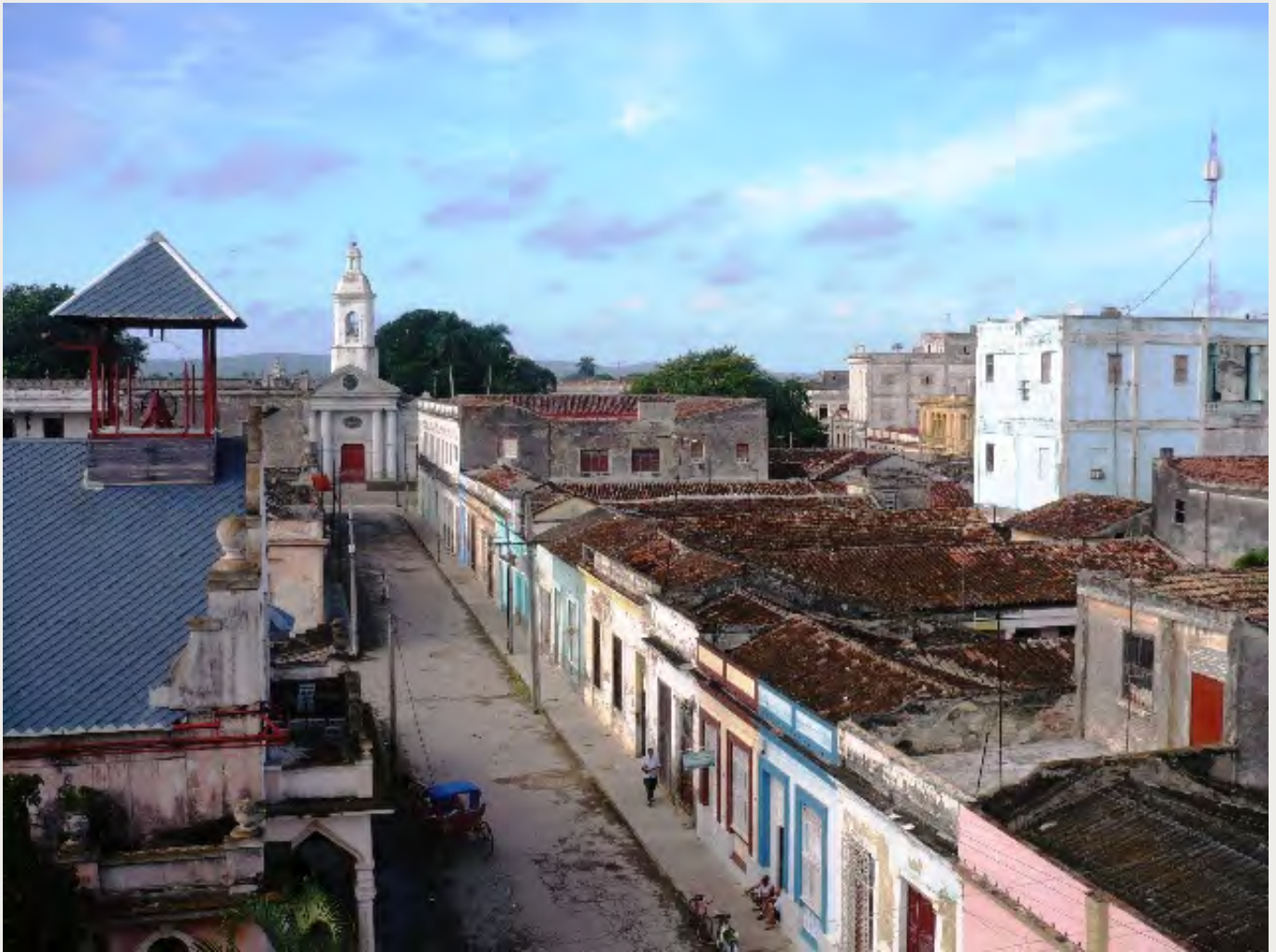
Sagua as of today