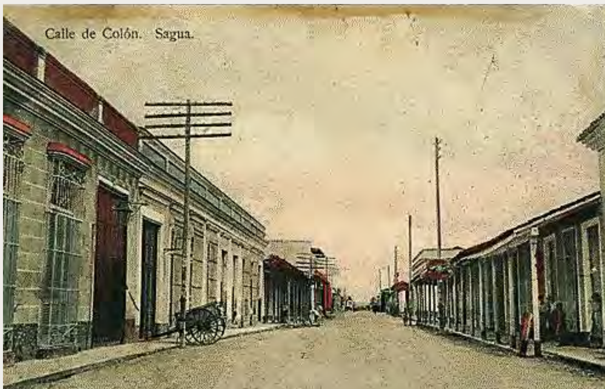
A View of Sagua by the end of s. XIX

Sagua La Grande, a XIX century city, is an outstanding exponential of the Neoclassical style in Architecture in all of Cuba. During the second half of that century, a great number of towns and cities are being born in the country, due to the expansion of sugar industry. Many of the countryside people started to group in the emerging towns, around the sugar mills.