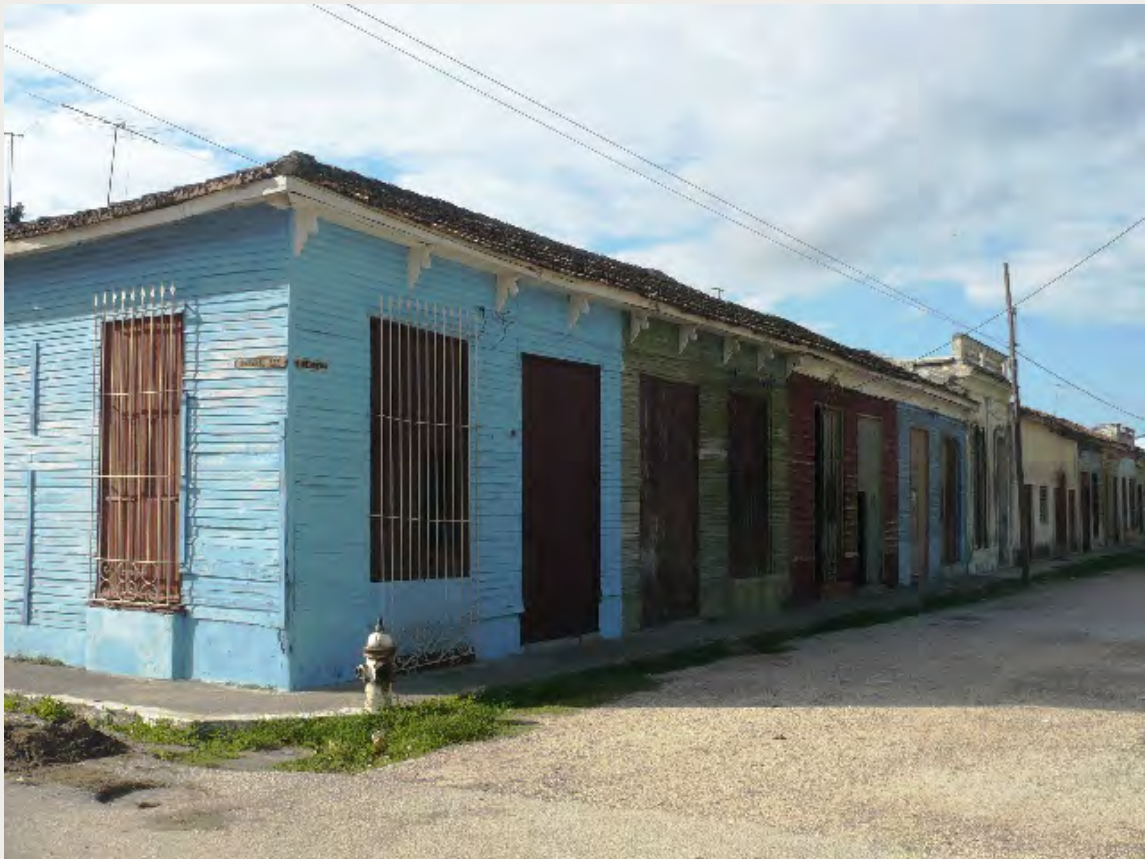
Vernacular wood as continuous constructions

In some areas of the urban screen this wood constructions are built as continuous units divided by party walls, sometimes extending to the whole block and even around the square block. It is very interesting to see the way the splashboards are treated on the roofs of these buildings due to the different solutions used in them. Sometimes a simple piece of board, curved cornices supporting the roof, some other times we see wooden struts and brackets with different figures that sometimes include zoomorphic stylized ones. Traditional Sagüeran ironwork is also always present with a wide array of designs to close the windows and some other parts open in the wooden facades.