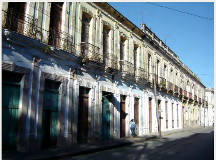
Republican buildings. s. XX