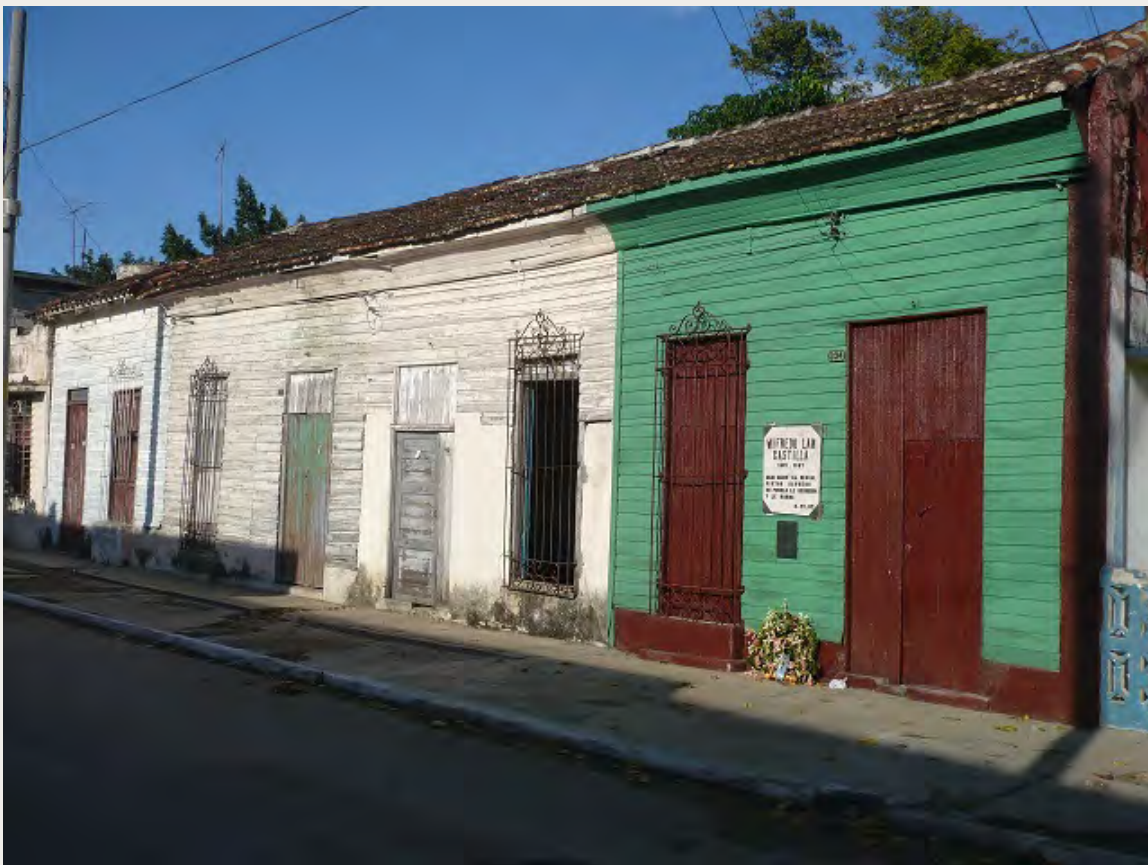
Birthplace of painter Wilfredo Lam