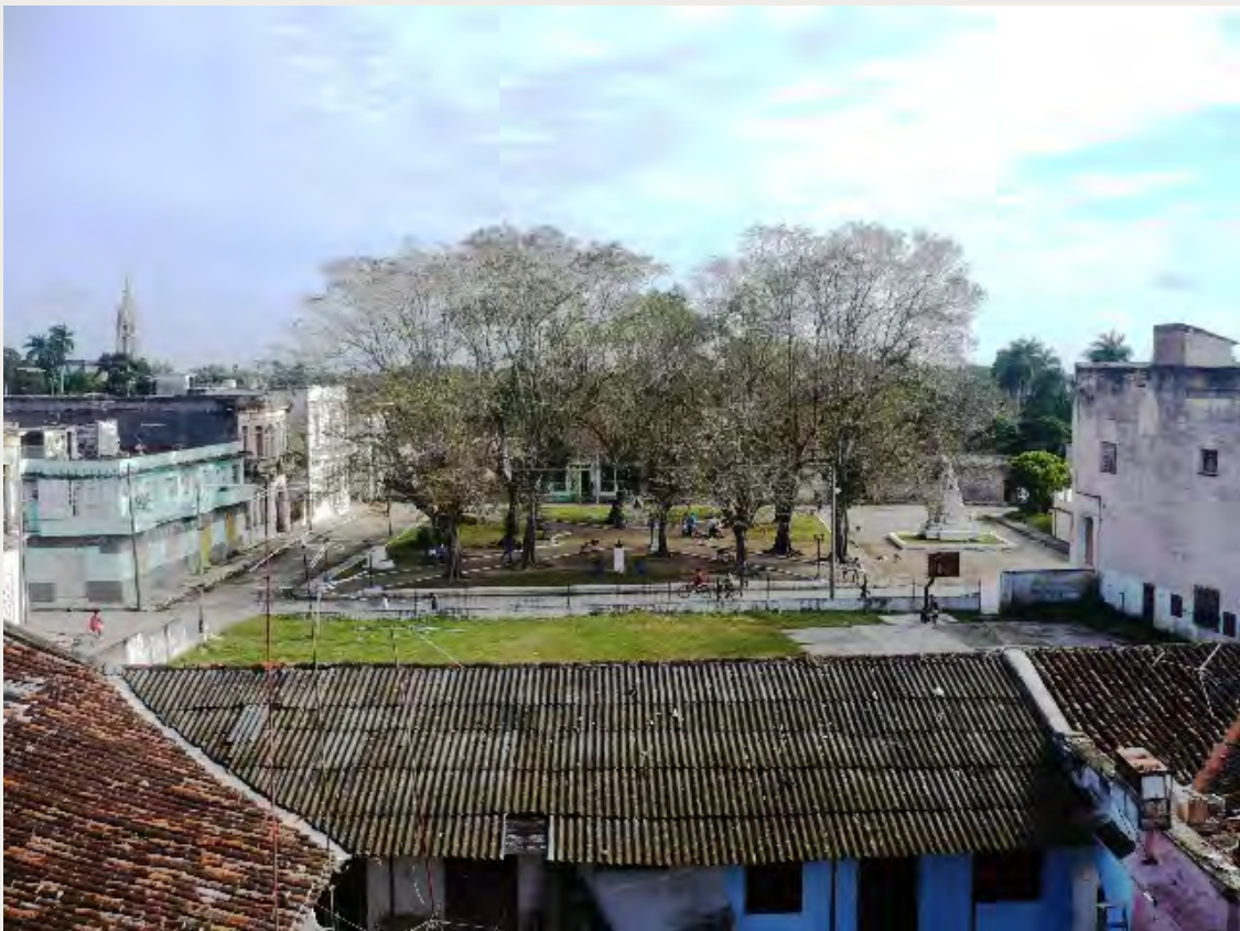
City's Founding Place