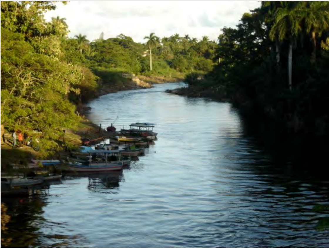
Sagua La Grande River