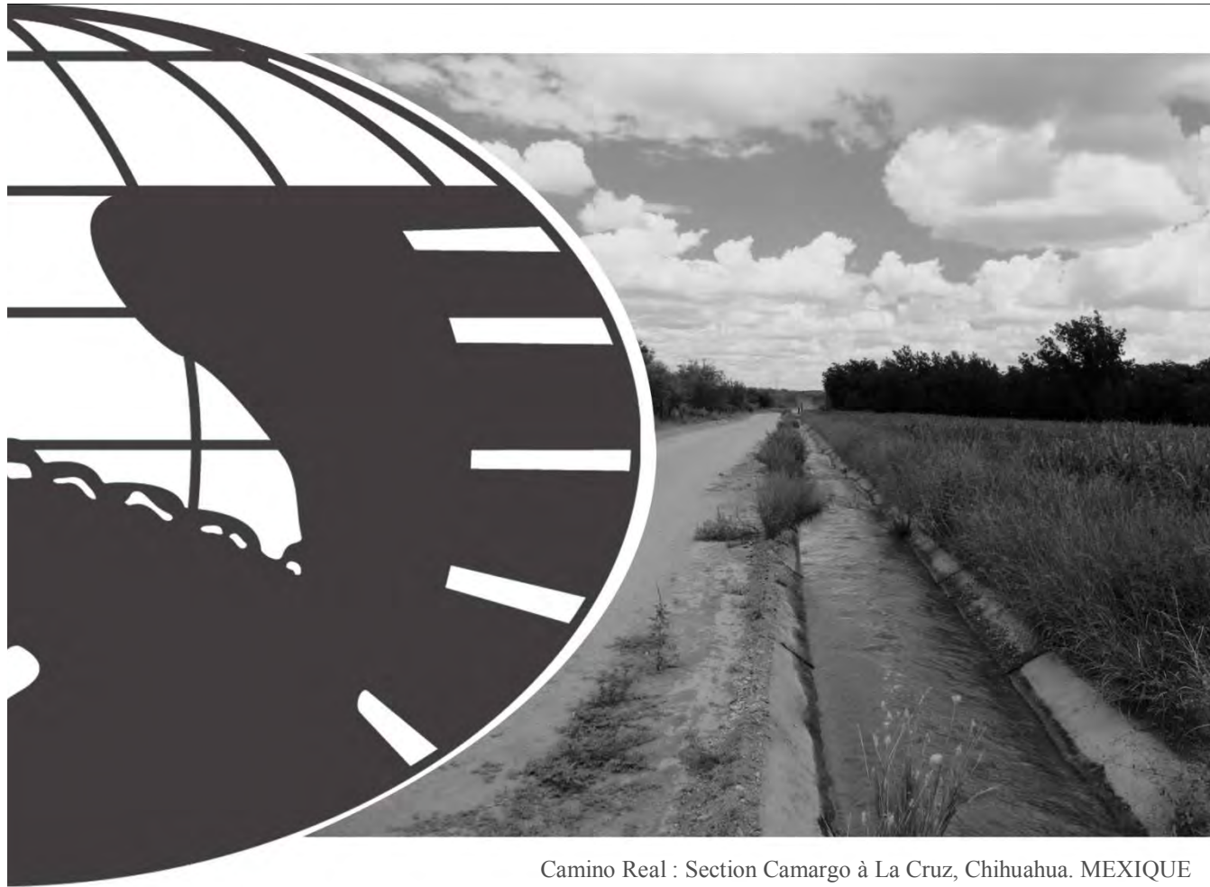
Camino Real : Section Camargo à La Cruz, Chihuahua. MEXIQUE