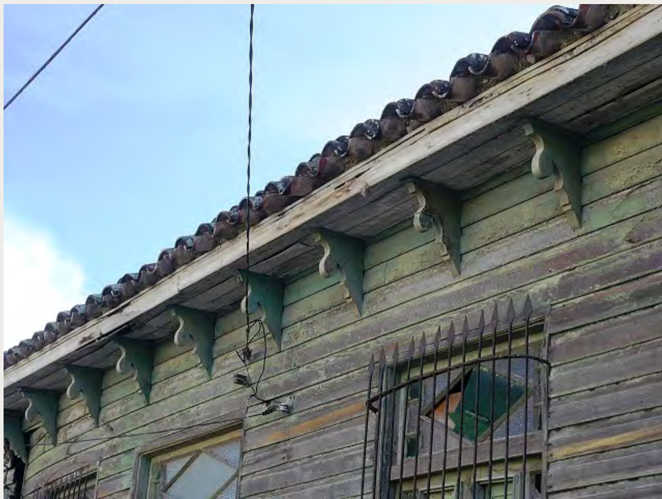
Splashboard detail on the roof.

Inside the constructions we always find a dividing element, almost every time with arches that separate living room from family room. Here like in almost every other town in Cuba and the Caribbean region these dividers are also called medio-punto arches. Along with them, we also find iron grids and stained glass rectangles to top the doorways and windows. This glass door and window tops can be colorless or colorful, but always transparent or translucent, sometimes with geometrical motifs, many other times with radial ornaments.