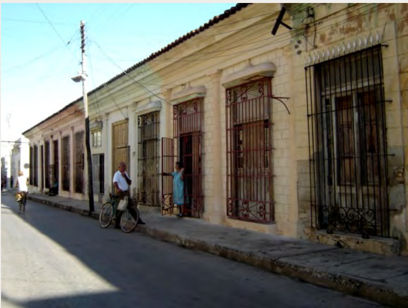
Colonial buildings. s. XIX

Sagua La Grande keeps a very important set of Colonial –XIX century- and Republic – first half of XX century- buildings. Colonial architecture is easily recognized because of the predominance of neoclassical decorative motifs, very delicate and finely executed. Its transition to the XX century is expressed through a very particular eclecticism which gives a great ambient and architectural coherence to the whole of Sagua's historic center. There are also included other expressions of arts in Architecture like Neo Gothic, Neo Colonial, Art Nouveau, Art Deco, as well as Wood Architecture, which is the one I specially want to refer to.