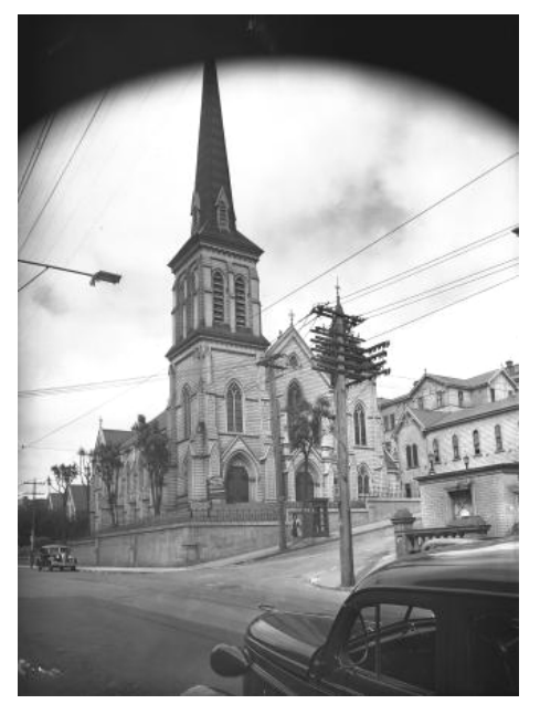
Fig 3 St John's from Willis/Dixon St corner c. 1940