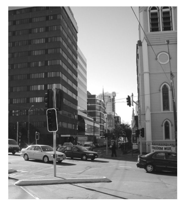
Fig 7 View of St John's Church from Ghuznee/Willis Streets Corner 2005