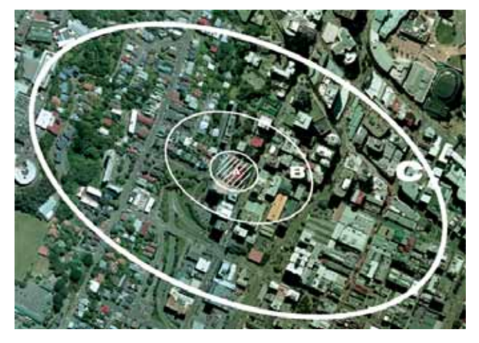
Fig 8 Diagram showing the historic setting of St John's Church Heritage Area A = the legal boundary, B = the immediate