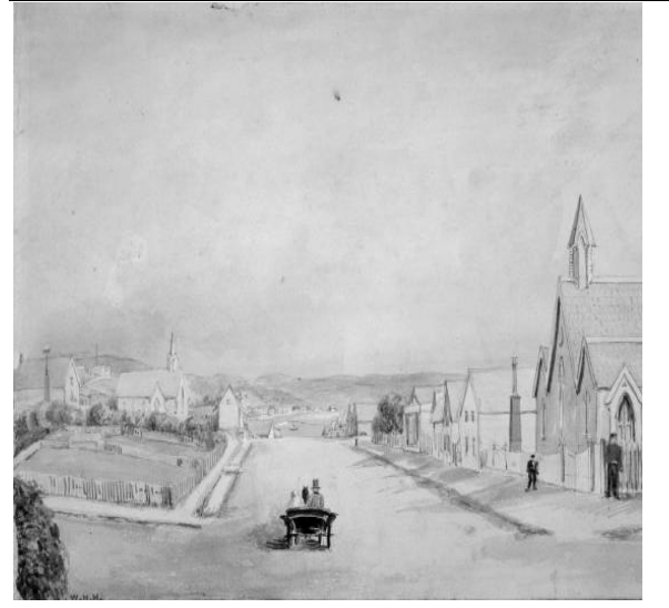
Fig 5 Water colour Willis Street by W.H. Holmes, ATL B-121-015