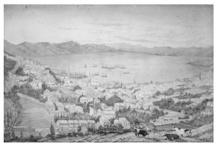
Fig 1 Water colour by Christopher Aubrey is a anorama of Wellington in 1889 from Brooklyn hills showing the spires of St John's and St Peter's in the distance ATL C-030-025

Fill Barbaral / New Zealand Heritage Policy Advisor Welling City Council