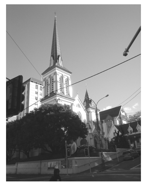
Fig 4 View of St John's Church from Dixon/Willis Street Corner 2005