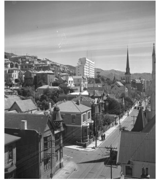
Fig 6 View from the intersection of Ghuznee and Willis Streets looking north along Willis Street, toward St John's Presbyterian Church (on the left) and Dixon Street Flats (centre) 1942, ATL ¼ - 000821