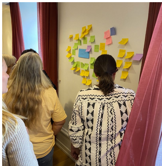
Visby Workshop 3 groupwork 1