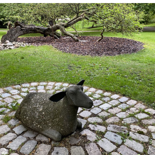
Visby Botanic Garden

This Part of the Connecting Practice Phase IV report (Part 1) describes the working methods used to develop the Wayfinder Heritage, the challenges encountered and lessons learned as well as future perspectives about its further development and integration with other heritage management resource materials.