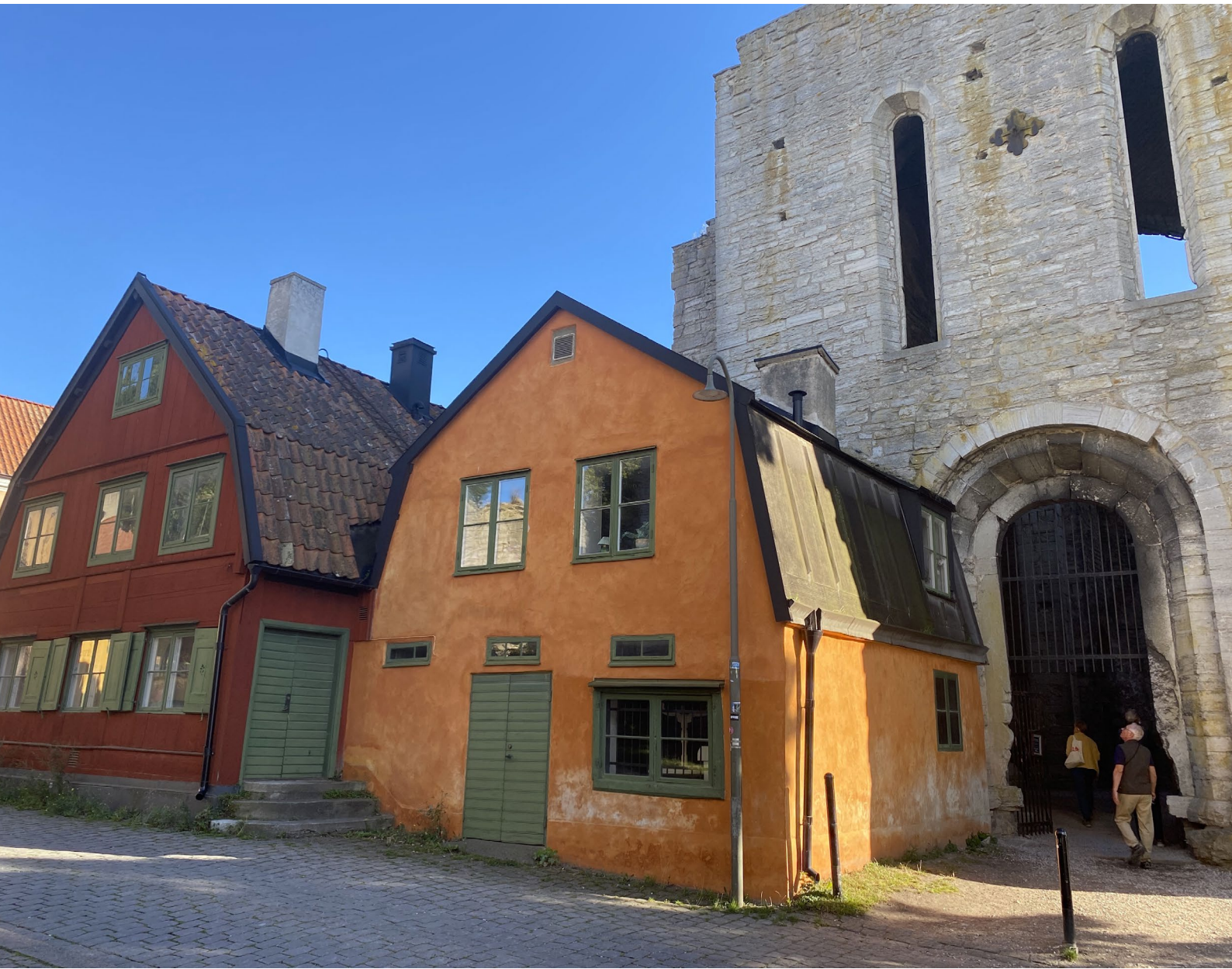
Visby houses and church ruin © Steve Brown