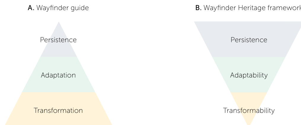
Figure 3.3. Relative focus on persistence versus adaptability and transformability in the Wayfinder guide and the Wayfinder Heritage framework

Second, not all elements of a heritage place are necessarily attributes. For instance, in a forest recognised by its biodiversity not all plant species will be considered as attributes. This will certainly be the case of invasive species. In such cases, transformation, in the sense of eradication or at least control, of those species is desirable. This means that sometimes certain elements in a system need to adapt and even transform for others to persist. Therefore, transformation in a heritage place must be considered but in relation to the elements of the heritage place that are not considered attributes.