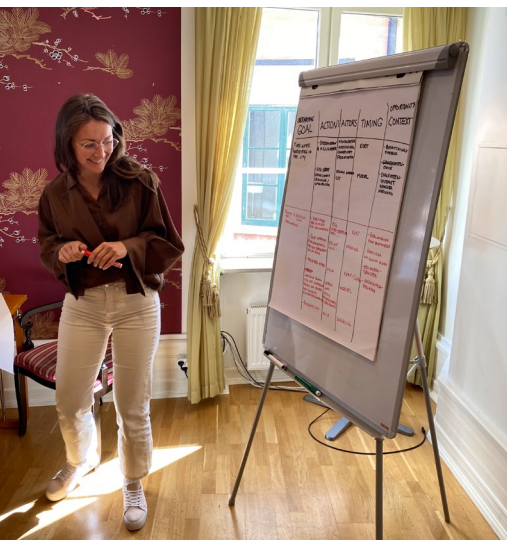
Visby Workshop 3 presenting groupwork

The study and its outcomes will be published separately from this Final Report. The study will make a significant contribution to understanding the way in which the Wayfinder Heritage has been delivered and the improvements that could be made to the process (and content) in future iterations.