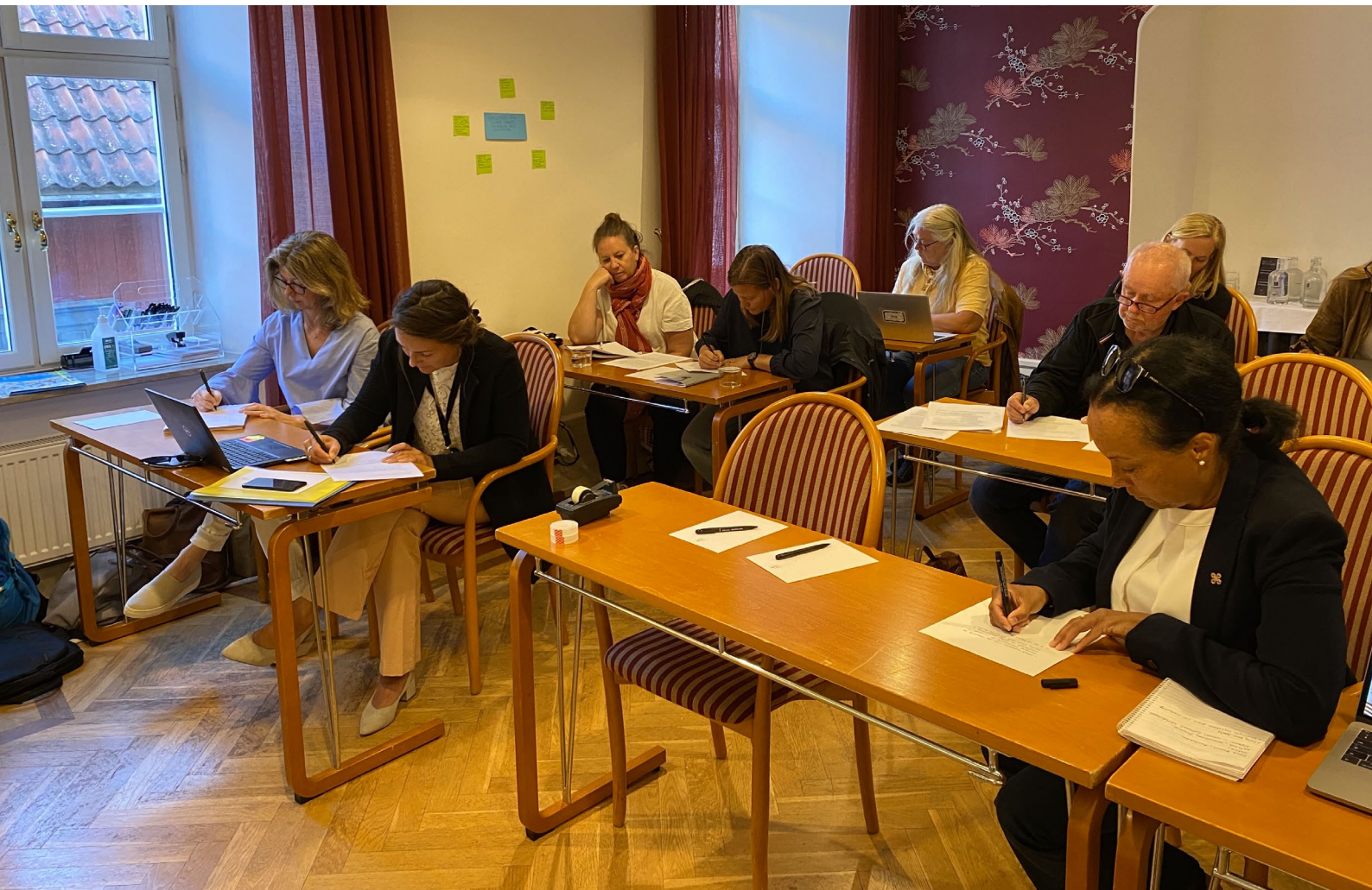
Visby Workshop 3 participants

To reach the full potential of the Wayfinder Heritage, ICOMOS and IUCN are keen to support further testing of the framework at other heritage places and adapt the framework according to the outcomes of the testing.