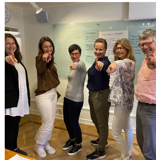
Visby Workshop 3 presenters