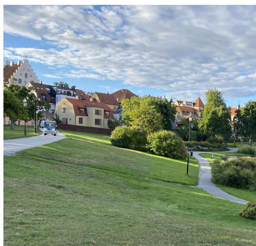
Visby from harbour area