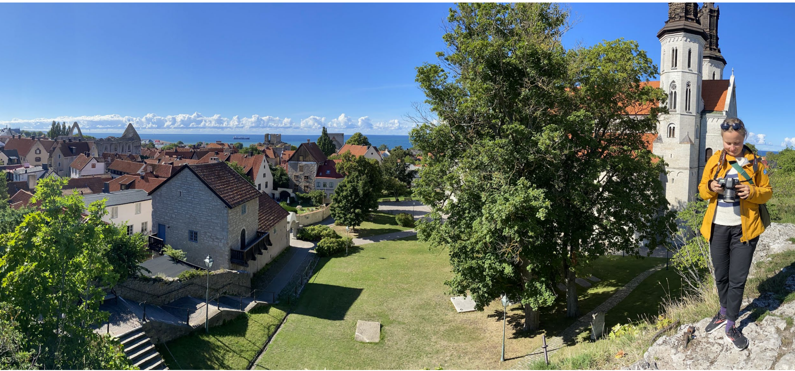
View over Walled town of Visby

the methodological steps included in Wayfinder Heritage framework, these methods can constitute powerful tools for heritage managers to conceive and understand the possibility of very different futures for a heritage place; particularly if certain challenges are ignored, or insufficiently tackled, or addressed too late.