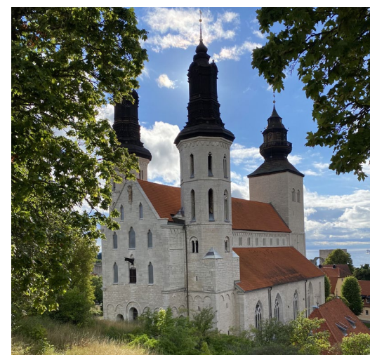
Visby Cathedral