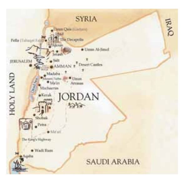
Fig.1 The map of Jordan.