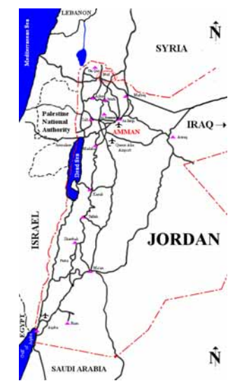
Fig.2 The principal routes of Jordan.