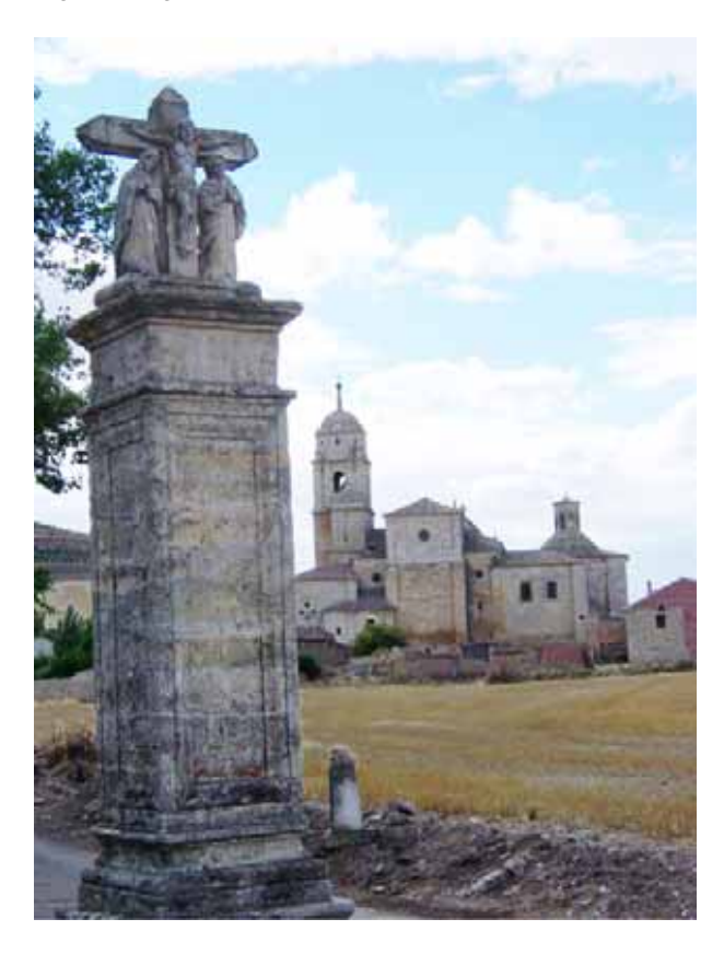
Fig 4 Crucero and Colegiate Churc, Castrojeriz