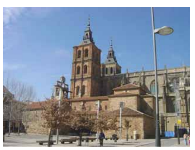
Fig 3 Astorga Cathedral