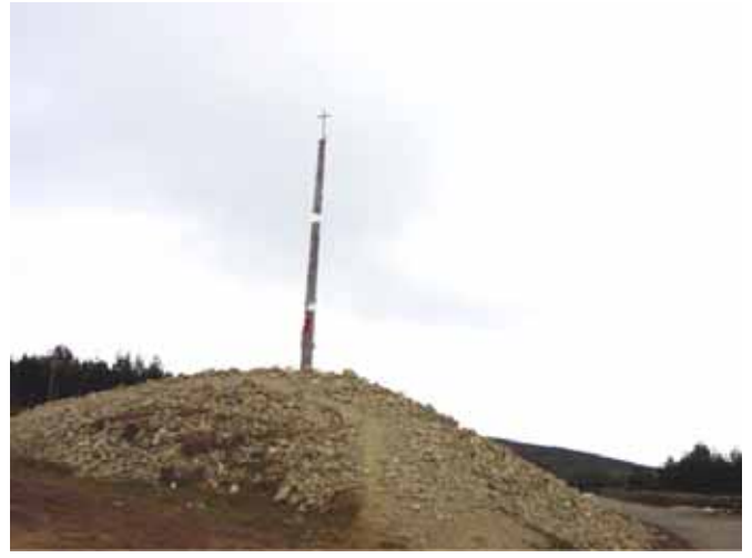
Fig 5 "Cruz de Ferro", Monte Iriago