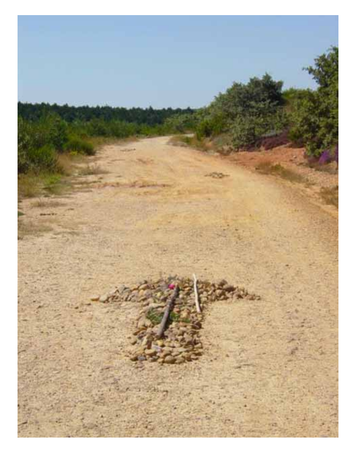
Fig 8 Signal of the pilgrims (Montes de Oca, 2004)