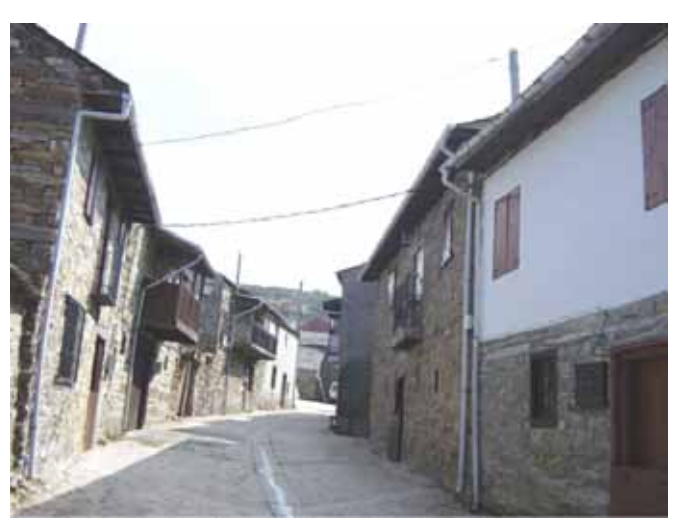
Fig 6 El Acebo (Ei Bierzo, Leon)