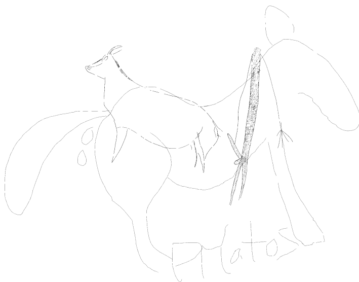
Fig. 2 – Drawing of all motifs now present in Penascosa's Rock 17. Drawing of the horse by the author from digital photography. The horse's drawing was digitally superimposed upon the drawing shown in the preceding Figure.

In the security report for October 5 th 2001, the guard states that a party of hunters passed by the site. They descended from the top of the hill and had an aggressive attitude. Their guns were loaded – by law they are obliged to carry their guns open and unloaded when passing through non-hunting areas such as the Penascosa rock art site – and the guard was menaced. Their quarrel was that they had come from far away (from the Vila Real area, some 100 kms to the northwest of the Côa Valley) to hunt and that now due to the restrictions imposed to protect the engravings they could not do it in Penascosa. Since a few days later, when we went on a regular monitoring visit to rock 17, the horse was already present in the panel it is very likely that the graffiti/vandalism 'artist' was in this group although impossible to prove it.