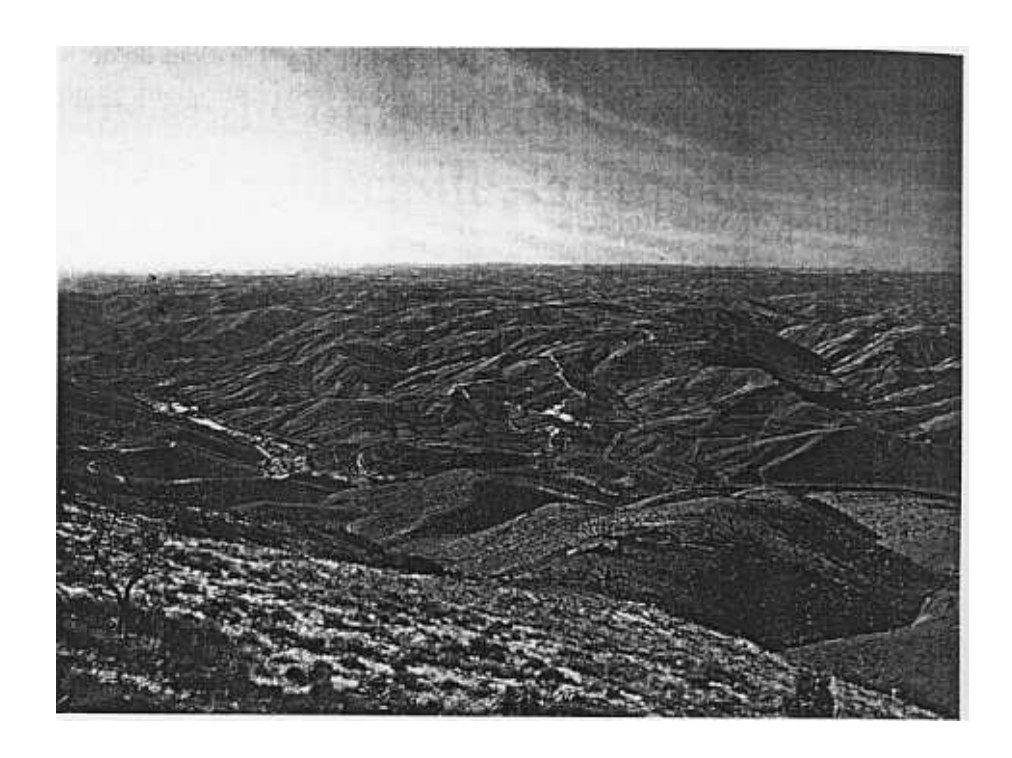
FIGURE 1 Area of the Côa Valley. One of the most important port wine estates in the region, Quinta de Santa Maria de Ervamoira, can be seen in the background.

preferred the dam, the construction of which assured them a steady flow of income for at least two years. Local stakeholders felt that an urban elitist minority (stakeholders themselves, nevertheless) who had never paid any attention to that underdeveloped rural interior area of Portugal had imposed the creation of the park and subsequent halt in the dam construction (Gonçalves 2001a). Within the Portuguese administrative and political system, the creation of an archaeological park of roughly 200 square kilometers under the Ministry of Culture caused evident turmoil in the relationships between public institutions. Divergences occurred among the existing agriculture, land management, and environment agencies but mainly with the local administrations, who were heirs to a strong municipal tradition in Portugal.