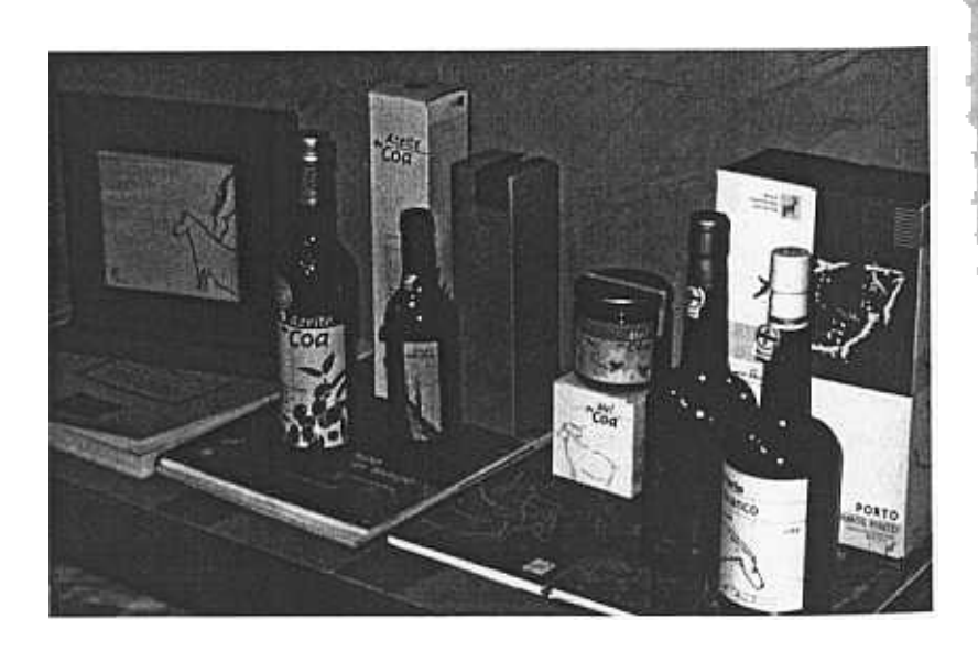
FIGURE 5 Some of the local traditional agricultural products that the PAVC sells in its reception centers: port wine, honey, and olive oil.

Instrumental to the success of this slow but steady process of changing mentalities was the PAVC's standpoint Although seeking the active involvement of all stakeholders, the park strongly supports national, international, and especially regional or local stakeholders who maintain as a goal of their management philosophy the offer of quality products and services. In the long run only a culture of excellence (based either on already existing "products"-rock art, Port wine, olive oil, gastronomy, or landscape—or on new, genuine, and socioecologically sound products) will determine and maintain the success of sustainable development for the region. Among the examples of stakeholders using this approach are local and national government institutions, restaurants, cafés, teahouses, hostels, onve on producers, tour operators, and Port wine farmyards, some with hosteling facilities or small on-site museums. The above-mentioned stakeholders are experiencing good results as a consequence of upgrading their offerings and also of their association with the Côa rock art World Heritage brand (fig. 5) (see Fernandes 2003:103-4).