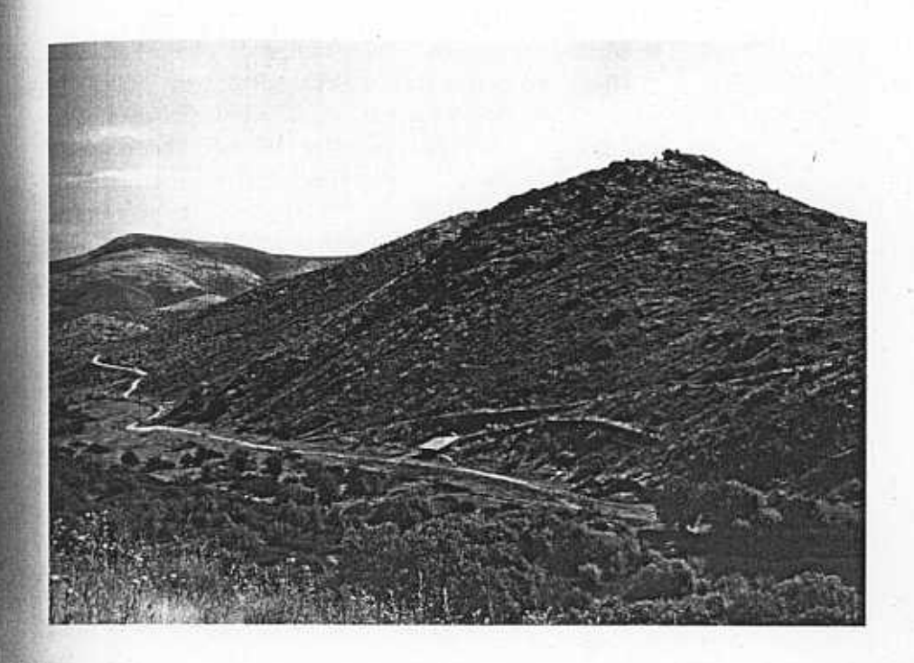
FIGURE 2 View of Penascosa rock art site. One can imagine the negative impact that ill thought and intrusive mass tourism structures would have on this quite unspoiled and picturesque landscape.