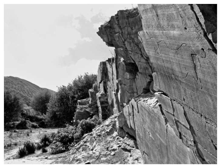
Figure 2 – The tangled horses of Piscos.

Nonetheless, even if these processes have a common origin, their