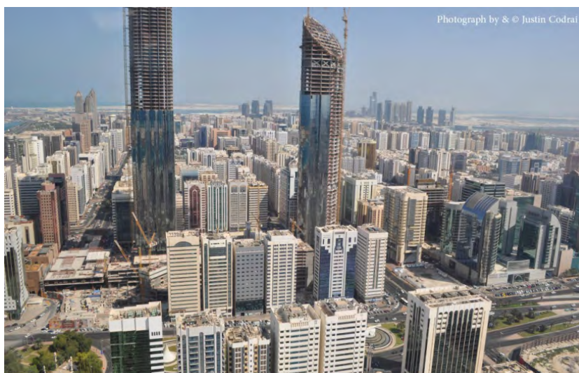
Figure 2. Abu Dhabi City, 2011, with the mixed use buildings of the new Central Market by Norman Foster + Sons

Although oil was discovered in the late 1950s, the modernization of Abu Dhabi was only made possible through the distribution of oil wealth and land through the vision of Sheikh Zayed Bin Sultan Al Nahyan when he became ruler of Abu Dhabi in 1966. Although always reaching a dizzying pace, the rate of development fluctuated over time as a function of the income from oil production, according to a study by Abu Dhabi's early planner, Dr. Abdelrahman Makhoulf (Makhoulf 2010). Building infrastructure, providing amenities, sustaining growth and implementing development have been concrete signs to build a feeling of prosperity and financial security necessary to maintain social cohesion and political unity, particularly in a nomadic society that had had such a difficult past.