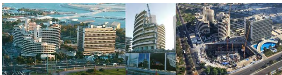
Figure 9: ADNOC Headquarters: in early 2000s (left), 2007 (center), 2010 (right)