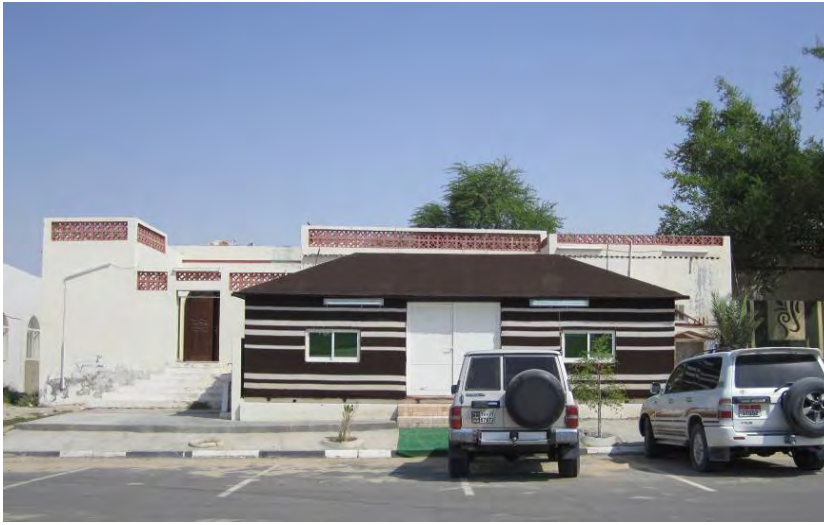
Figure 3. Emiratization of early modern housing with the construction of a ‘majlis’ (or receiving room) clad with canvas to resemble a traditional tent with added amenities of air conditioning and tinted windows.