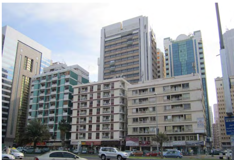
Figure 5. Building heights and typologies are indicative of different trends and a product of economic concerns to maximize on land value.

Provincial areas or areas of slow growth are being aggressively developed to catch up at the expense of their unique identity: for example, while it is clear that amenities should be provided in the Western Region such as improved roads, is it necessary to rearrange and partially demolish the first Emirati housing neighborhoods built in the late 1970s to impose a rigid street grid in order to implement the best practices of urban design [FIGURE 6]? In areas that are heavily developed of the Emirate, particularly in Abu Dhabi City, visibly vital areas are being redeveloped because their physical appearance and architectural style are no longer appreciated. In addition, to accommodate for the speed of development, a cookie-cutter approach to building services has often been preferred: for example, in developing the education system across the emirate, a number of identical schools with teachers' accommodations. Similar looking bus stations and police stations are being planned as well. Rather than be contextualized with the identity of their environments, these designs fit the new trend of institutional re-branding to assert a strong emirate-wide message; thus, the lack of site-specific designs and choices of styles is hindering the distinction of localities [FIGURE 6].