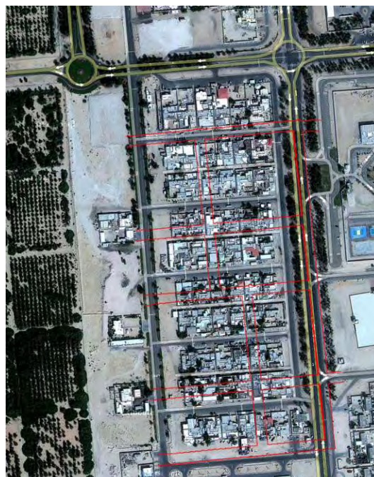
Figure 6. Impact of rigid street grid proposal on existing historic national housing in Ghayathi, Western Region. Houses within the red outline are subject to demolition.

The vicious cycles of urban renewal are also breaking down social relationships. For example, the Central Market, built in the Central Business District in the early 1970s, was a space memorable for its liveliness and informality, conveying an authentic bazaar-like atmosphere. The Central Market was recently demolished and replaced by a modern high-end mall attached