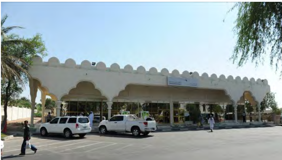
Figure 4. Built in the early 1980s, Medinat Zayed Bus Station combines many traditional Islamic details.