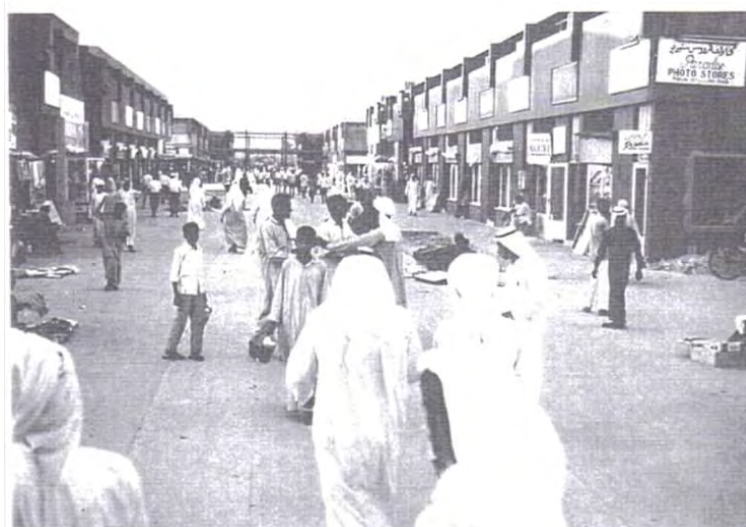
Figure 7. Old Central market in the early 1970s

The notion of cultural heritage in Abu Dhabi has emphasized the intangible. Because of the nomadic roots of the local culture, poetry, storytelling, hunting, folklore, crafts, etc... are traditions that have lasted over the centuries. Although archaeological excavations began in the late 1960s, appreciation for