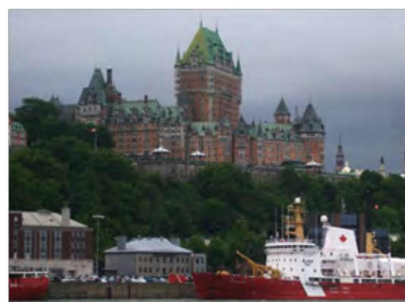
Figure 7. Old Québec, Canada.