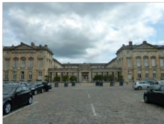
Figures 4-5. Compiègne, France.