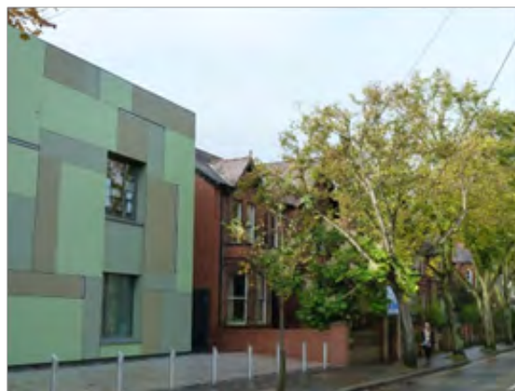
Figure 10. Uniformization pressure, Malone HUL, Northern Ireland.

include the listed building ‘Piney Ridge’ 166 Malone Road (ownership: private); the Methodist Church, Lisburn Road (ownership: church); no’s 2-4 Holyrood (ownership: university) and Mentmore Terrace, Lisburn Road (ownership:private). Many other historic villas are boarded up as a prelude to anticipated demolition. In the Conservation Area the pressure for demolition and damaging new development