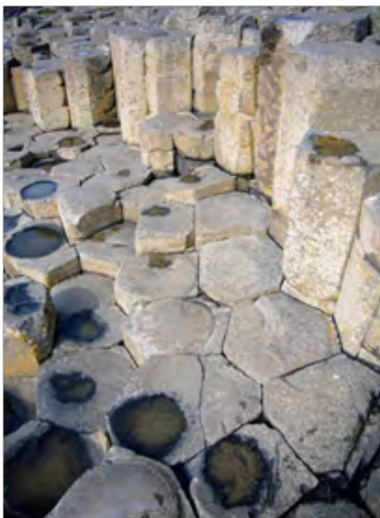
Figure 8. Giant's Causeway, Northern Ireland.

The Giant's Causeway, as a natural site, plays a powerful role in establishing the Province's sense of place, with its hexagonal forms being immediately recognisable. A new £18.5 million visitor's centre is currently under construction for this location. In June 2010 the case was submitted for inclusion of the Malone and Stranmillis suburb and Historic Urban Landscape, South Belfast on the new UK Tentative List as a potential UNESCO World Heritage Site. Historic Urban Landscapes convey a unique cultural identity in their own right and they achieve this outside of purely protecting landscape within historic urban centres. Not one site was shortlisted from Northern