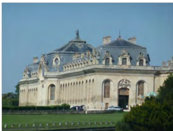
Figure 2. The Grand Stables, Domaine de Chantilly, France.

Sustaining a sense of place 'genius loci' is critical for cultural diversity, for the benefit of human kind, both current and future generations. The Guidelines provided