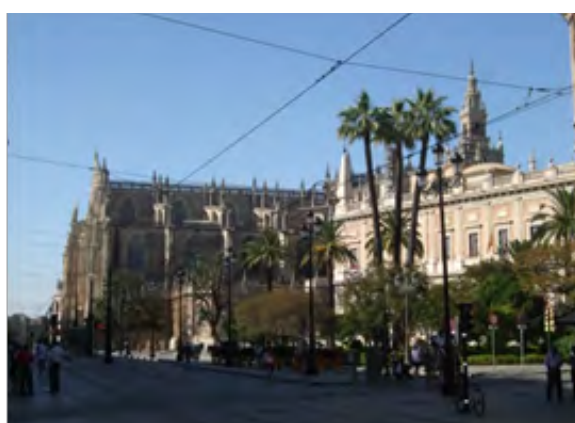
Figure 6. Seville, Spain.