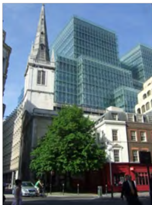
Figure 1. Uniformization pressure, London.

Put simply, there are two main paths which heritage as a driver of development can take. The first path is towards uniqueness so reinforcing a sense of place