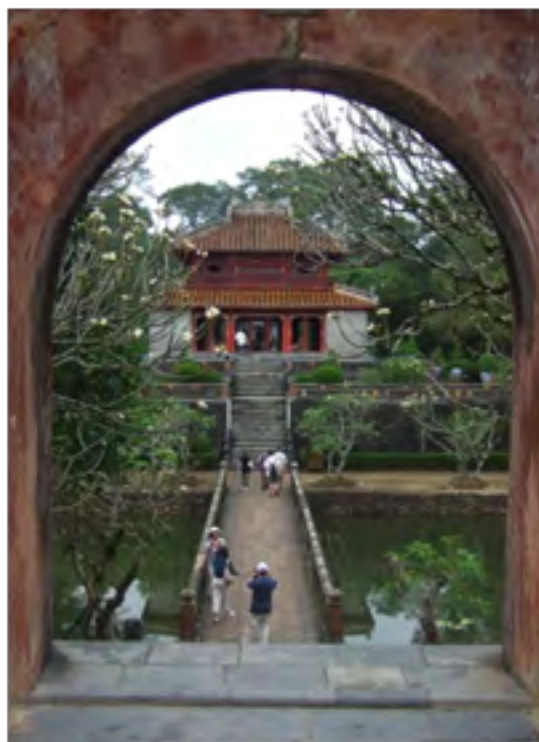
Figure 9. Hué, Vietnam.