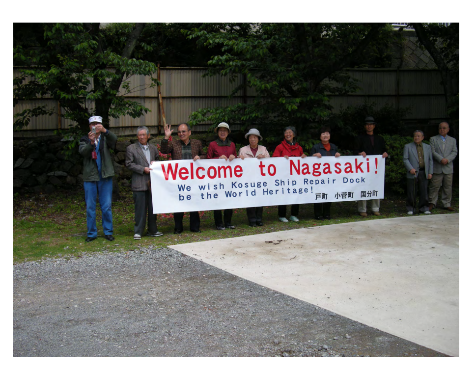
At the Kosuge ship repair dock in Nagasaki the local community expresses its enthusiasm for World Heritage nomination

Many of these post-industrial landscapes have an intrinsic value, in terms of their history and archaeology. This transcends any usefulness that adapting them for new