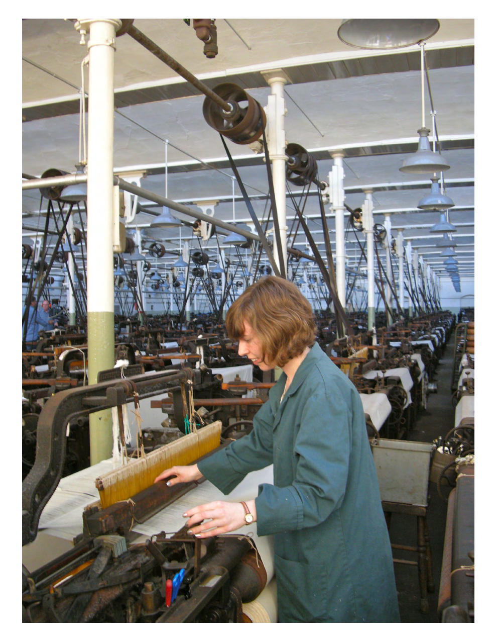
Queen Street Mill, Burnley, Lancashire, England. There were 79,000 looms in Burnley in the 1890s. Queen Street Mill is all that remains, the last steam-powered weaving shed in the world. Built in 1894, its 308 looms today offer post-industrial audiences a vivid insight into the workings of a typical Victorian mill. Here is industrial-strength heritage at its most challenging — a site of world importance taking its chances in a climate of harsh economic forces.

treated as such. They set new challenges; for national conservation agencies unused to the scale, technical and economic demands of designating and managing post-industrial landscapes; in the development of new conservation criteria suited to the peculiar needs of industrial heritage; in terms of the technical conservation of industrial ruins and the management of their decay; in public access, understanding and interpretation. For ICOMOS and UNESCO too the industrial past as world heritage demands new ways of thinking, for often these places lie beyond the boundaries of pre-existing convention. All over the world a new conservation ethic is evolving in response to these needs.