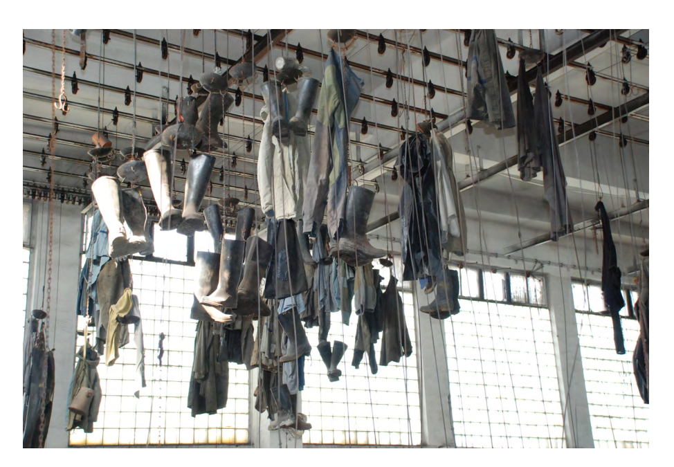
The presence of absence. Miners clothing from the last shift at the Kladno collery in the Czech Republic. Evocative evidence like this often affords a more vivid and certainly more authentic view of a working past than re-enactment.