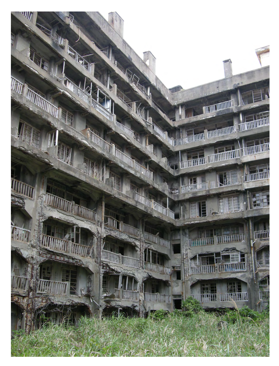
Gunkanjima Island, off Nagasaki, an abandoned coal mining community where dramatic decay presents a commanding expression of former importance. Unmanaged decomposition may offer the most authentic means of retaining character and originality.