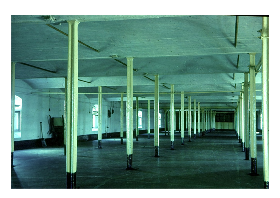
To precious to lose, too fragile to use. Ditherington Flax Mill, Shrewsbury, England, built in 1796-7, is the world's first iron-framed building. Its intrinsic value is beyond question but our general assumptions are that for a mill or warehouse building to be retained a new use must be found for it.

A prime example has been Emscher Park, the regeneration of the vast brownfield landscape of the Ruhr valley in north-west Germany. Another has been in the revitalisation of Liverpool. In France the Nord-Pas de Calais offers an extraordinary diversity of coalmining remains; five generations of winding engines,