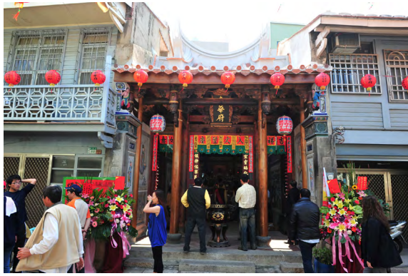
Figure 2. Shop houses and temples in Tainan's street.