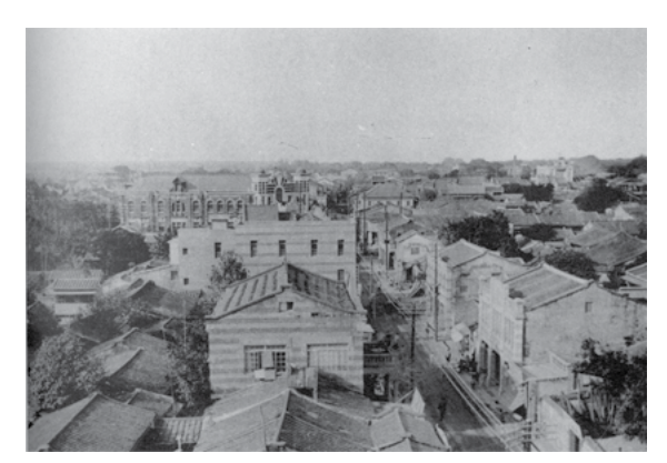
Figure 1. Tainan's street scene during the Period of the Japanese Occupation.

The expansion of the city beyond its former boundary had made possible the provision of new urban facilities and the development of a modern city. However, the employment of western gridiron road system with circles at nodal points did great harm to the existing urban fabric. Public buildings and the new generation of street houses were soon built according to the new city plan, leaving behind the main streets former urban fabric. Governmental buildings were built according to western classical architectural norms giving a sense of austerity, modernity, and ruling authority. In the meantime, quite a few churches were constructed in this period helping create a specific townscape in certain areas.