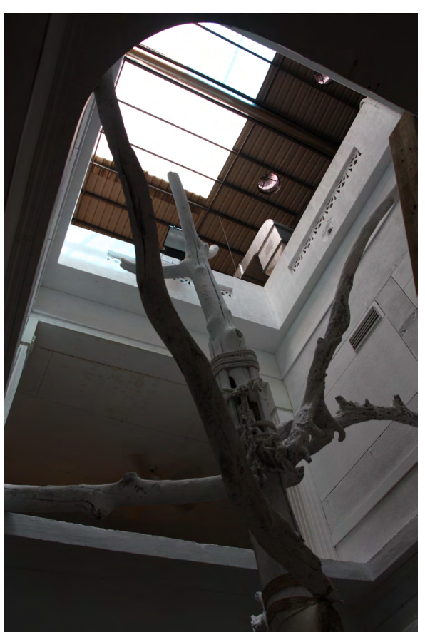
Figure 3. Cases of the "Old House with New Life"