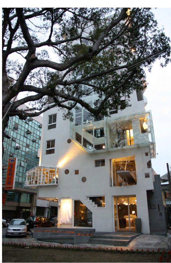
Figure 6. One case of "Old House with New Life"

Since the promotion of the "Old House with New Life" concept by FHCCR in 2008, an amazing design method that intervened with the old house became a new pattern for space reuse. Moreover, Tainan's unique city atmosphere formed a special kind of spatial atmosphere. In the process of spatial development in Taiwan in the 1990s, the "Eslite Bookstore" took Taiwan by storm through its simple Taipei metropolitan style. Hence, the "Eslite Bookstore" was developed into a specific type of consumer identity and cultural identity. The "Old House with New Life" concept formed with Tainan City as the basis has gradually been transformed into a reformed space in appearance, which has been extended to other cities. Compared to the "Eslite style" that features the commercial and elite characteristics, the "Old House with New Life" conceived in the south has had the chance to return to the "ensconced" essence of life. After this cultural project became a growing trend, it was more important to rethink about the fundamental spirit.