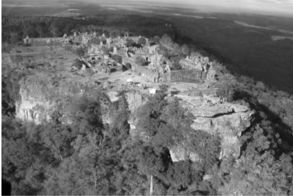
Figure 1: Temple of Preah Vihear perched on its high plateau with Thailand in the background. 25