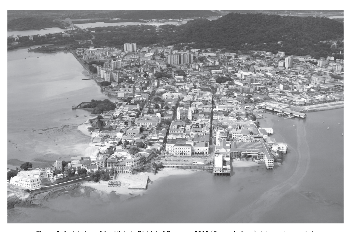
Figure 2. Aerial view of the Historic District of Panama, 2010 (Casco Antiguo).

In the same manner, let us see the justification of the criteria of OUV presented by Panama for the inscription of the Archaeological Site of Panama Viejo on the World Heritage List, as an extension of the property Historic District of Panama with the SalónBolivar.