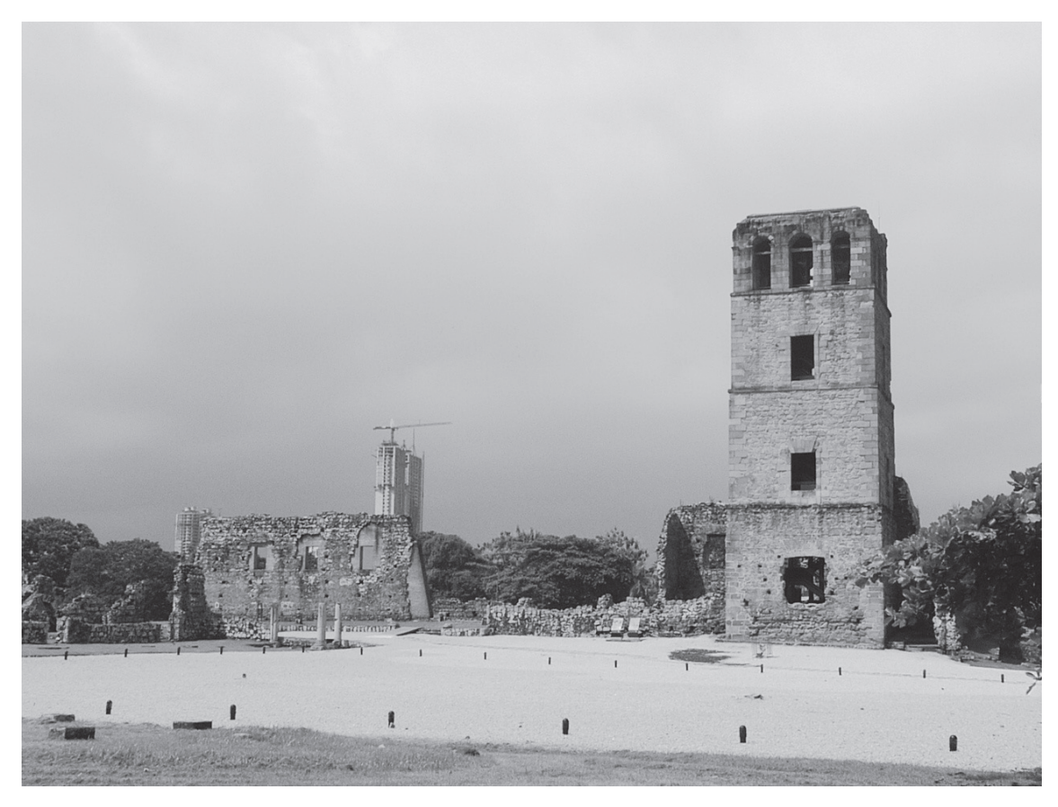
Figure 3. Cathedral of Panama Viejo, plaza Mayor and Terrín Houses, 2006

It was reaffirmed on Decision 27 COM 8.C.40 by the Committee, that the same criteria of OUV (ii), (iv) and (vi) according to the Operational Guidelines for the Implementation of the World Heritage Convention ( those that justified the inscription of property Historic District of Panama with the Salon Bolivar in the year 1997) were valid as justification for extension of the property that included the Archaeological Site of Panama Viejo, thus unified as the World Heritage property now called Archaeological Site of Panama Viejo and Historic District of Panama (Panama) (790bis).