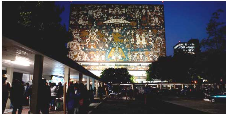
Figure 3. Night activities under the Central Library at the main campus of the CU.

Today CU is not the same; it has changed both in its physical presence and symbolic and historical absence interpreted through the eyes of its beholders. CU has transformed, its myth remaining faithful to its past and in the new light of its present. It has become a living museum where sculptures, architecture, murals and landscape are enjoyed by students and tourists alike.