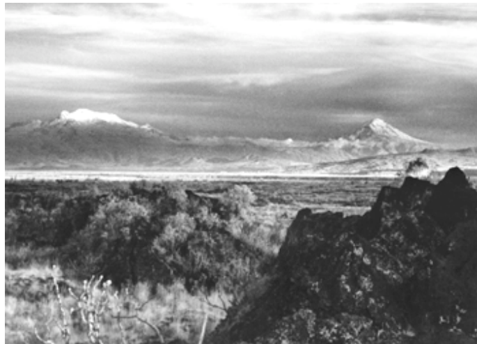
Figure 1. Original Volcanic Landscape of CU (CU files)

symbolic importance. Along with the academic buildings the sports area represented a very important part of the project. The handball courts and the CU stadium are the most significant elements (Pani, and del Moral, 1979). The courts were designed by Alberto T. Arai to mimic the neighboring hills of the Sierra de Las Calderas and to create a perspective by placing each fronton or wall, made of volcanic rock, on a different plane, giving the appearance of the ancient pyramids. The stadium's design has also been praised for its harmony with the site, creating the illusion that the stadium has always been there. The height of the structure was diminished by creating a slope on the periphery and by covering it with volcanic rock.