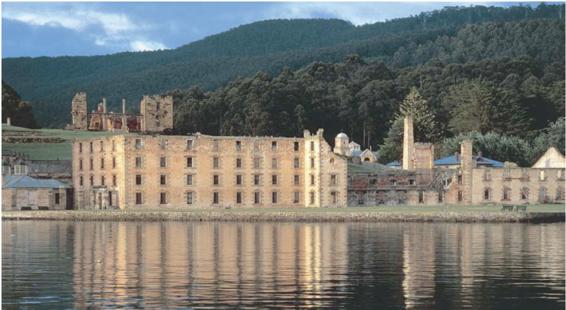
Figure 2. Port Arthur Penitentiary Building. A Tasmanian icon.

A number of families have long term connections with Port Arthur, dating to the township period. In some cases, these families lived in houses now within the Port Arthur Historic Site, which were subsequently restored or demolished. For many members of today's community, the Site was once the place they called home, worked in, went to school, farmed, had children and simply lived. Their ongoing involvement is one that involves a sense of attachment and 'ownership' (PAHSMA 2007, 41–42).