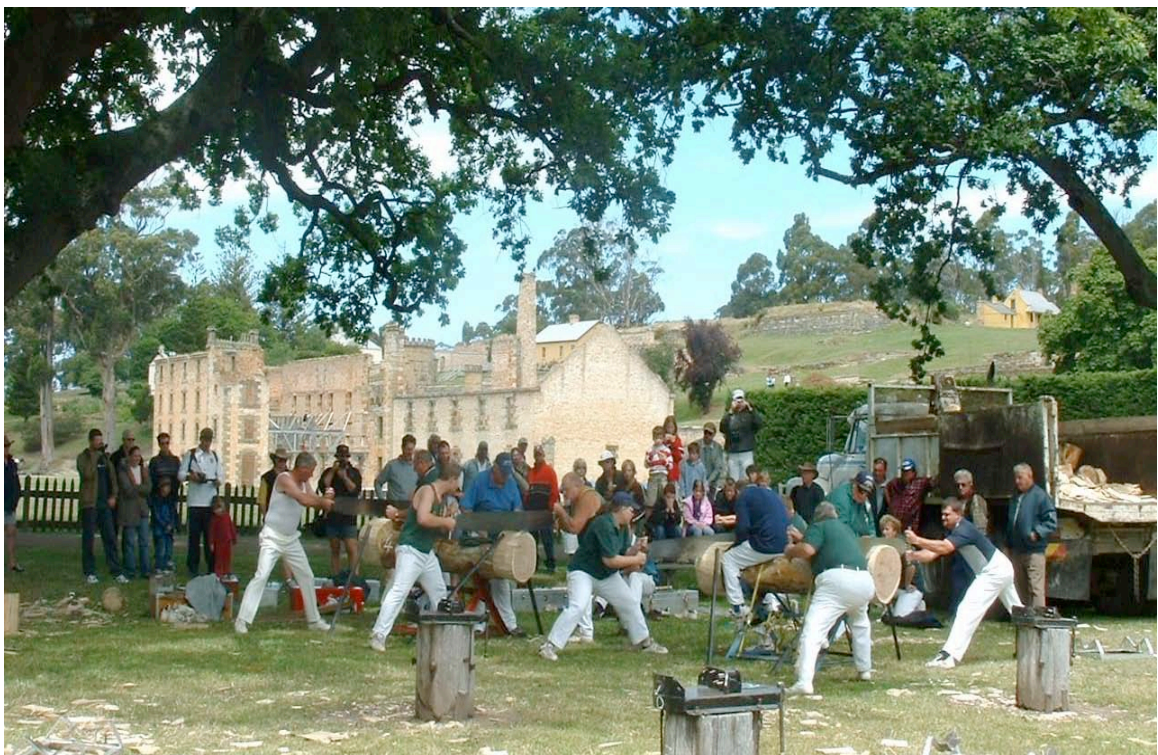
Figure 4. Boxing Day Woodchops.

by the government, or have been passed on through memories of that time. A number of community activities are still part of practices and engagement with the Site. Local fishermen continue to access a jetty within the Site and a small fishing fleet is moored close by. One of the enduring local traditions and an integral part of the heritage of the Port Arthur community is the boxing day wood-chops, held in the Site grounds. The chops, which sees competitors pitted against each other in various timber-cutting activities, are the remaining event of the Port Arthur sports day, which commenced in 1863 and is believed to be the longest running sporting event in Australia. Held annually, it attracts competitors and spectators from across Tasmania.