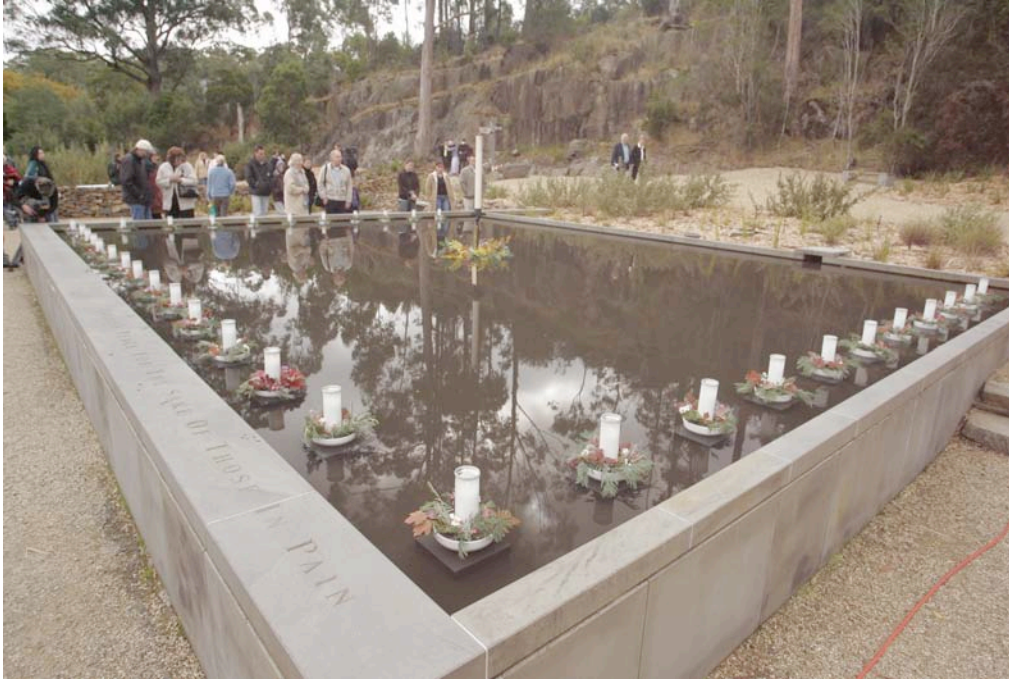
Figure 3. Memorial Pond and Garden.