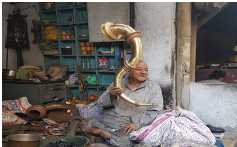
Fig. 2- Craftman with his craft - Narsingha, a musical instrument for Gurudwara

In traditional cities, the concept of the ceremonial centre is created and though the religion does not become the main causative factor it becomes the symbols of concentration of social and political power derived from sacrally sanctioned authority (Champakalakhmi, 1996:6). Amritsar has strong religious connotations with crafts. The evolution of the craft and its bazaars goes back to the period when Guru Ram Das 3 invited 52 types of artisans and craftsmen among other people, to settle around the Amrit Sarovar 4 . Later on, when the city was divided into Misal 5 and led by individual chieftains, craftsmen and traders were invited from all regions to come and set up business. In the 18 th century with Maharaja Ranjitsingh consolidating the Sikh empire, craftsmen and artisans were encouraged from all around to bring their practice to the city. Shawl-weavers from Kashmir and artists of the Kangra School of Art were among the most notable migrants. Some, like bazaar Papan, bazaar Kathian, Kanak Mandi were named for the product they offered, others, like Majithmandi (a market of dyers), Mandi Ahan Faroshan (for sellers of iron and iron ware) were named for the craftsmen and crafts to be found there (CRCI, 2010:).