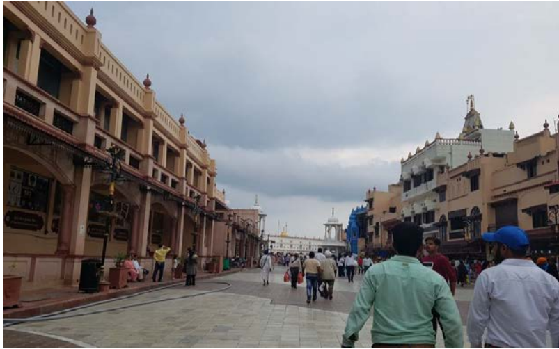
Fig. 3- The pedestrian pathway with the tourist shops

Today, the tourist movement gets restricted to the pedestrian walkway and the plaza and they are not allured to explore the bazaars nor do they come in contact with the artisans working in the lanes around. One of the important drivers of economy i.e. the tourism that has today become a cause for disconnect of the link between Bazaars and the temple which was established centuries ago.