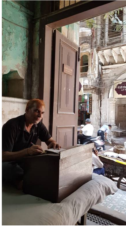
Fig. 4- Shops used as letter boxes