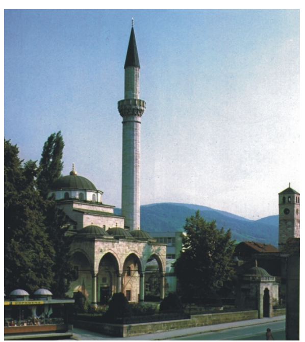
Fig.1- Ferhadija Mosque, 1983 (By Husref Redžić, courtesy of the Commission to Preserve National Monuments).

Despite incredible hardships, the Ferhadija Mosque was eventually rebuilt and reopened in 2016. The event was widely referred to as a sign of reconciliation and hope for the post-war city, but little research has been done on the effects of this highly publicized project. This paper will thus consider how the project contributed to the revitalization of Banja Luka's Muslim community and to reconciliation between the city's ethno-religious groups. It is based on preliminary findings from the first stages of the author's doctoral research on the post-war recovery of Ottoman-era Islamic sacral heritage in Bosnia, which included a review of existing research and an analysis of primary documents and secondary reports related to the reconstruction project.