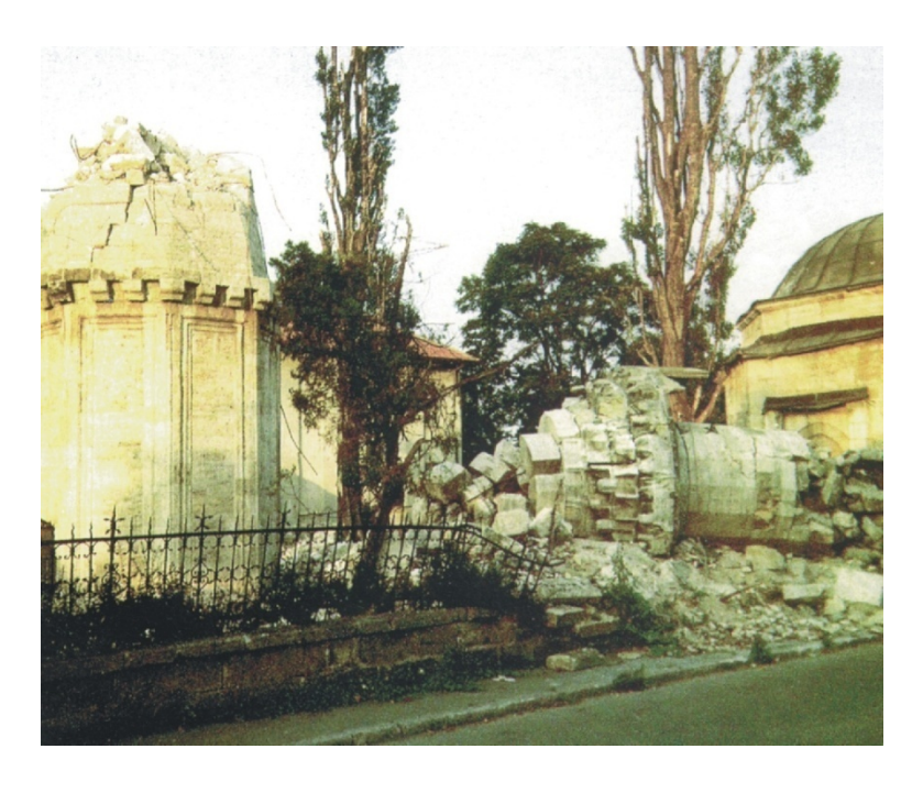
Fig. 2— Ruins of the Ferhadija Mosque minaret, 1993 (By Aleksandar Ravlić, courtesy of the Commission to Preserve National Monuments).