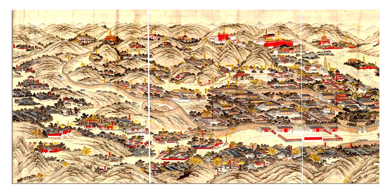
Fig.5 – The Mountain Resort with its Outlying Temples (Chengde, China. National Art Gallery of the United States.)

Since the beginning of the building the Mountain Resort by Kangxi to completing the construction of the twelve Tibetan style temples by Qianlong in the northeast of the garden, Emperor Qianlong also built a large number of Chinese temples, Taoist temples, and folk gods and other religious sites, and ordered the repair of the former dynasty folk temple. During the Republic of China, some of the data showed that there were more than one hundred and thirty temples in the Chengde area, except for the imperial temples. This respect and advocate the practice of multi-god worship, not only to balance the dominant position of the Huang Jiao, but also to promote the integration of all ethnic groups, and achieved the harmony between the gods and the people.