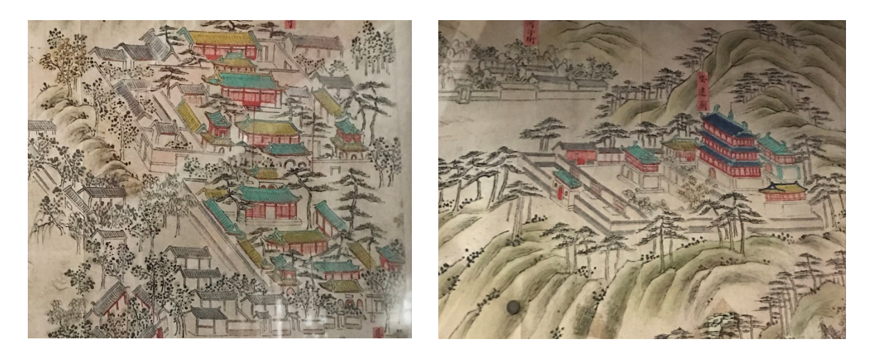
Fig.3–Pu Ren Si (The Mountain Resort Museum). Fig.4–An Yuan Miao (The Mountain Resort Museum).