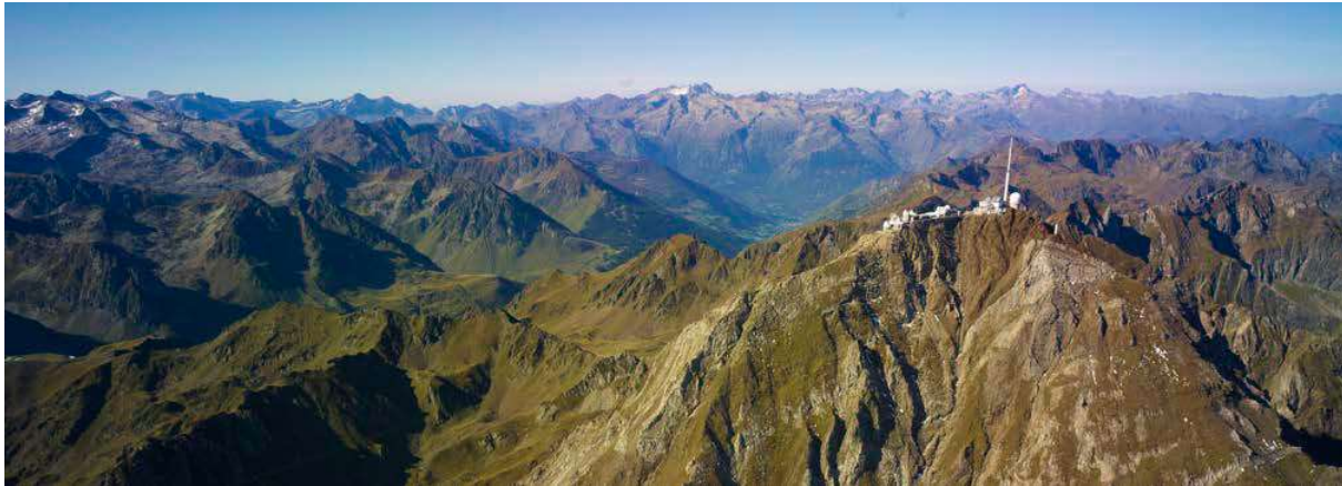
Fig.: Pic-du-Midi Observatory and Scientific Station: in regular use from 1883 1