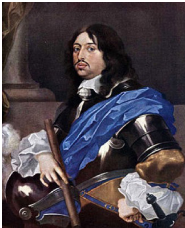
Charles X Gustavus 1622-1660

a part from the 12 th century) all through to Ladoga lake and the mouth of river Neva (the later site of St. Petersburg), Estonia, Livonia (parts of present day Estonia and Latvia) and several provinces and cities in northern Germany. The expansion at the cost of Denmark-Norway had been achieved by the daring military expedition from Jutland across the frozen-over Danish straits under the personal command of king Charles X Gustavus, an adventure which nearly knocked the Danish realm over. In 1660, however, the King's concluding effort to capture Copenhagen failed and Bornholm and Trondheim had to be restituted. Then the King died, at the age of 37. His waistline is reported to have measured two meters.