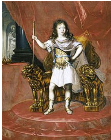
Charles XI at the death of his father

1660 marked a turning point: hundred years earlier another king, Gustavus Vasa, had died after nearly forty years of successfully resurrecting the Swedish State from many centuries of internal family feuds and wars with Denmark over succession. There were now two Scandinavian powers with defined borders, confirmed royal lineage and constantly at odd's end. Gustavus's grandson Gustavus II Adolphus entered the internal religious wars of the Holy Roman Empire, and when they finally ended in 1648, Sweden had gained the northern German provinces – in addition to much booty acquired during the many years of criss-crossing Swedish troops throughout central Europe. Though the Swedish war efforts had largely been financed by France that had an old bone of contention with the German emperor, there was no question that Sweden had become one of the major power players on the European stage. But how could this continue? The population of Sweden incl. Finland has been estimated at 1.675 million in 1650, Germany had roughly 10 million inhabitants (having been decimated by 5 million since 1600). England and Wales had 4.5 million. France (in 1670), 18 million, and Russia 15 million. The only comparable neighbouring power Denmark with Norway was populated by approximately 1.25 million. 1