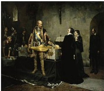
Charles IX defaming the corpse of his enemy Klas Fleming. Albert Edelfelt

Orkneys into Iceland and Greenland, in nine gigantic sheets, the Carta Marina . It has remarkably vivid illustrations of people and fauna, ships and crafts, and mythical animals. His Historia de gentibus septentrionalibus was published in 1555. It was a work of great originality, describing not just the history of the Goths but also the nature and environment. It told tales of climate, mountains, rivers and lakes, of religion and superstition, of Finns and Lapps, and of Amazons, and the everyday lives and crafts of the population. Its aim was to portray a people living in a land of great natural beauty, but also containing enormous challenges during dark and cold winters, all of which had contributed to the fostering of a nation of heroes. 16