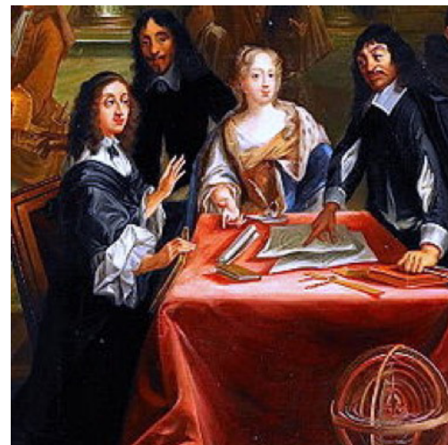
Queen Christina (left) with Descartes (right)

The Italian connection, however, is interesting from quite another viewpoint. Abdicated queen Christina, a cousin of the deceased Charles X Gustavus, had resided in Rome since 1655 after her conversion to Catholicism. There she developed tight and sometimes complicated relations with the popes and the Vatican administration. She kept a keen eye on what was going on in Sweden from where she would get the main source of income to maintain her court in exile. When news about her cousin the king’s death reached her in 1660 she decided she had better visit Sweden in order to look after her interests in person. Her entourage consisted of fifteen persons. Negotiations in Stockholm with representatives of the regency government were about finances, faith and succession, all touchy issues, where she would also have to meet the man she had once humiliated, Magnus Gabriel De la Gardie. 37 It seems unlikely