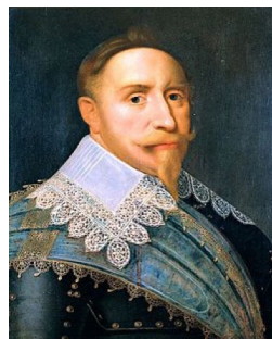
Gustavus II Adolphus

But the king’s death at the battlefield of Lützen in 1632 dampened the former rhetoric, and Gothicism took a somewhat different path. Now linguistic aspects came into focus. So far no other assumption had been thought possible than that the primordial language must have been Hebrew, Adam’s tongue. Now Georg Stiernhielm, one of the first antiquaries, with elaborate comparative studies of the Gothic language as it appeared in the newly discovered Silver Bible of bishop Ulphilas tried to assert a theory evolving from analysis, that Swedish was instead that first language.