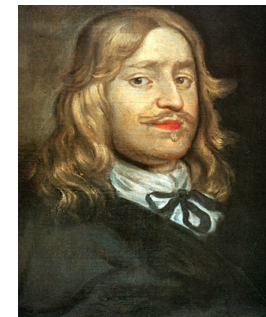
Magnus Gabriel De la Gardie 1622-1686

The grandson, Magnus Gabriel, having been born with a silver spoon in his mouth, made very good use of his starting position, holding early in life among other positions that of the ambassador to France. His wife was the sister of the now dead king Charles X Gustavus, and he had ingratiated himself with this king's predecessor queen Christina, his wife's cousin. Shortly before her unexpected abdication in 1654, he fell out of favour with the queen and exiled himself to his many landed estates. Now, in 1660, in the will of Charles X, he was named Chancellor of the realm.