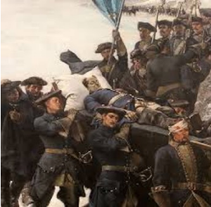
The Funeral Procession of Charles XII. Gustaf Cederström 1878

How well the placat came to be respected by the population at large is difficult to tell. Inventorying, however, was ongoing during most of the 17 th century and certainly saved many monuments from neglect and destruction. At the turn of that century into the next Sweden was involved in unsuccessful wars which took most of the attention and resources away. When Charles XII was killed in 1718, autocratic government ended and the Parliament effectively took over. Less interest went into the study of the past. The 18 th century came with the Enlightenment and a study of the present and the future.