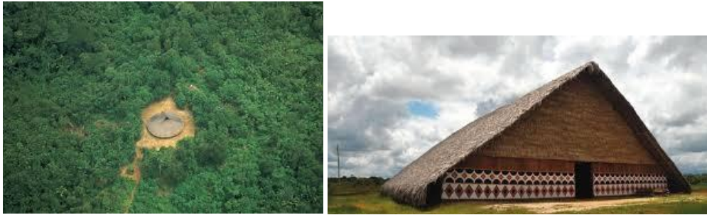
Maloca is an ancestral communal house, used by the natives of the Amazon. It is a sacred space, built by the community and represents life itself. It is replaced every ten years approx. when the group moves to another place to allow the regeneration of the area where they were settled.

These are works with traditional techniques of the indigenous cultural heritage, which periodically replace parts of the buildings, or the same building in its entirety, defining the concept of the conservation of the architectural heritage not only in the material framework, but also in the immaterial, as use and vocation of social practices and traditional management methods.