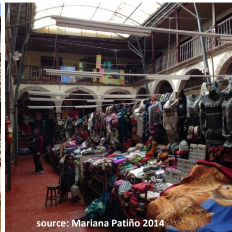
Tenants in the mansions of Cuzco's historic center

The preservation of these historical models has conformed to the adoption of international doctrines but has not been related to the community that inhabits them; while the historic centers are destroyed by the ruin of their architecture other indigenous manifestations begin to be incorporated as cultural heritage, arising with their own strength. Today's reading of the historical urban manifestations demonstrates the symbolic abyss that exists between cultures.