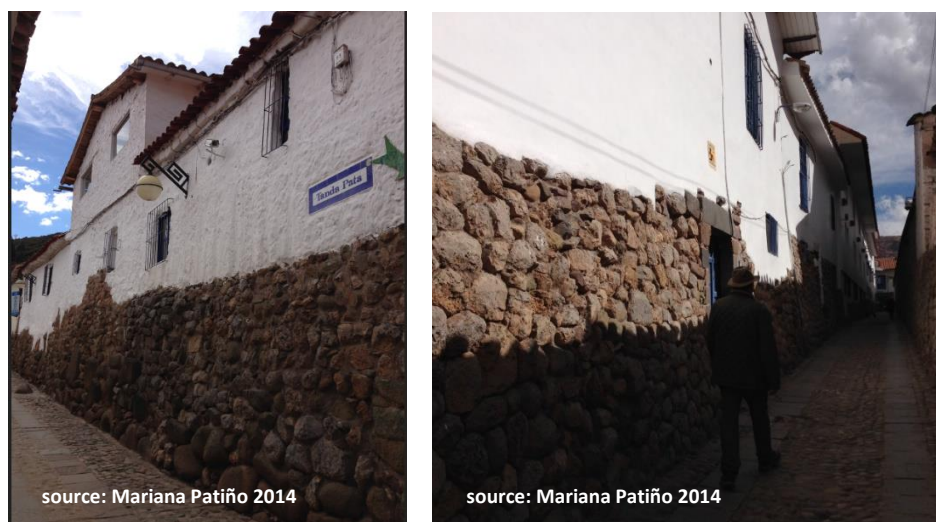
Historic Urban Landscape - streets in Cuzco

Another case is the city of Cuzco, where the acculturation process was and has remained, different. Formerly it was the capital of the Inca Empire and with the arrival of the Spaniards became one of the most important cities of the Viceroyalty of Peru. On top of the Inca stone architecture, the Spanish houses were built. Today the Historic Urban Landscape of Cuzco is proud of its outlines where the cultural syncretism is manifested in the conciliation of the Inca foundations and the colonial walls.