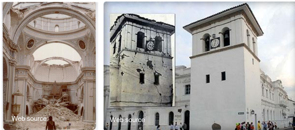
City of Popayan, Colombia, earthquake 1983 identical Reconstruction

Nothing is built for eternity, nor is it good for all ages. With the passage of time countless buildings will be subject to change of use, but others will manage to maintain their essence because the community will insist on their stability. Today's interventions will mark a new direction in heritage conservation, rescuing the meaning of the intangible values of architectural heritage as a spatial attribute that links with people and events.