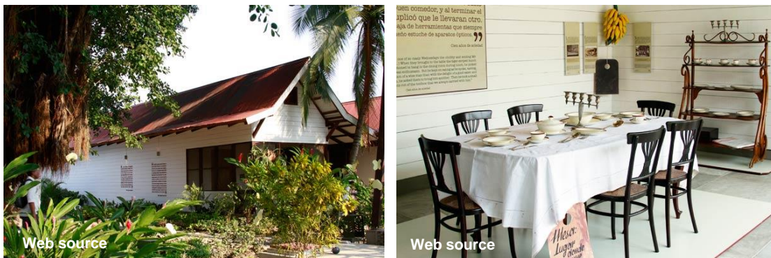
Reconstruction by oral tradition – Gabriel García Márquez's house

The reconstruction project led by the Ministry of Culture looked to recreate the characteristics of the architecture of the region, houses of planks and bahareque with zinc tile. This type of reconstruction could be considered as a modern component of the built cultural heritage, since it is a governmental interpretation of a place that seeks a physical anchorage for the memory of a historical figure.