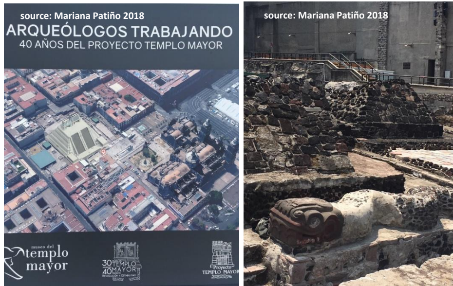
Templo Mayor Mexico City, Mexico

Another case is the city of Cuzco, where the acculturation process was and has remained, different. Formerly it was the capital of the Inca Empire and with the arrival of the Spaniards became one of the most important cities of the Viceroyalty of Peru. On top of the Inca stone architecture, the Spanish houses were built. Today the Historic Urban Landscape of Cuzco is proud of its outlines where the cultural syncretism is manifested in the conciliation of the Inca foundations and the colonial walls.