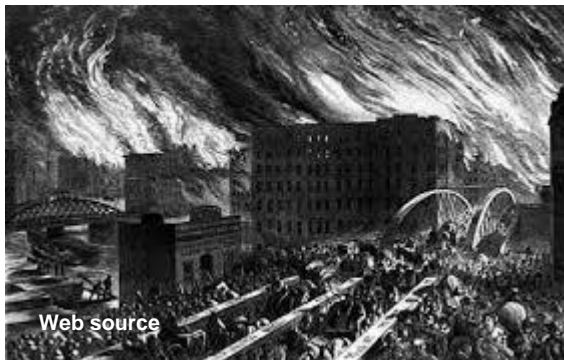
Artistic realization of the fire, by John R. Chapin, originally printed in Harper's Weekly The northeast of Randolph Street Bridge is shown.

In the great fire of Chicago approximately 6 square km of the 19 th century city was destroyed. The disastrous fire of 1871 lasted three days. As a result of the disaster, the fire code of the city of Chicago changed, making way for the age of the skyscrapers. The possibility of designing a new city was led by the emerging School of Chicago, founder of modern architecture movement. During the reconstruction period, creativity flourished and new ideas emerged to make Chicago the global icon of the modern skyscraper.