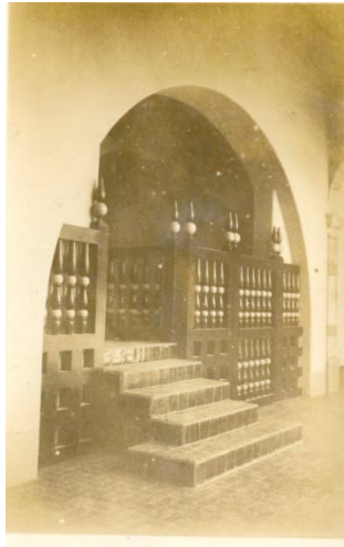
Figure 5. Robles León House, Luis Barragán, 1927.