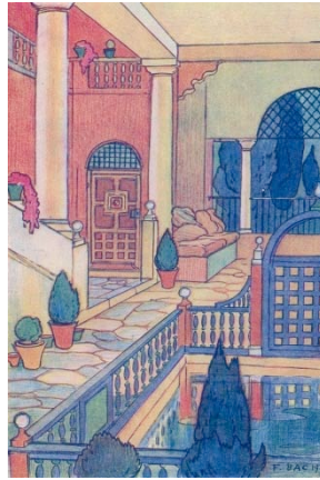
Figure 4. Image of Le bain de la Sultane . Ferdinand Bac, 1925.