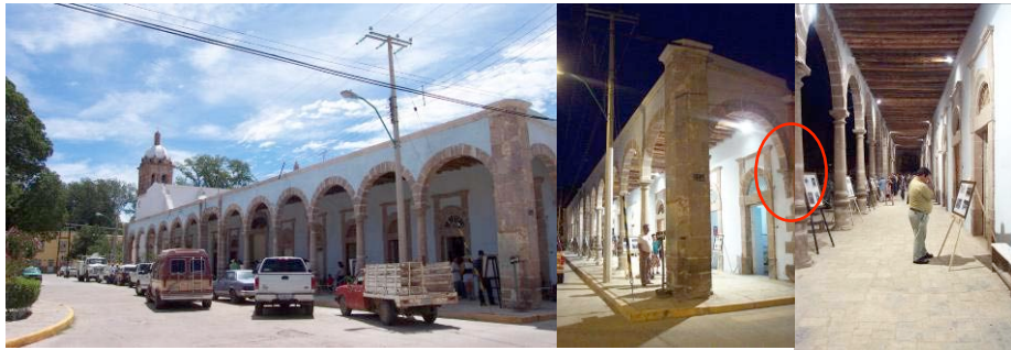
Figure 6. Left: North (main) front of Consistorial house; right: location of hand marked in red

However, this element that very well can be related with a whole system developed during the mentioned Golden Century, is not found in any other place in the State of Chihuahua, Mexico, or even Spain, according to the conversations held with Dr. Gomez Piñol (2001). It is a completely local representation that gives another dimension to the place's spirit, but it bonds it to a macrovision at the moment of its creation.