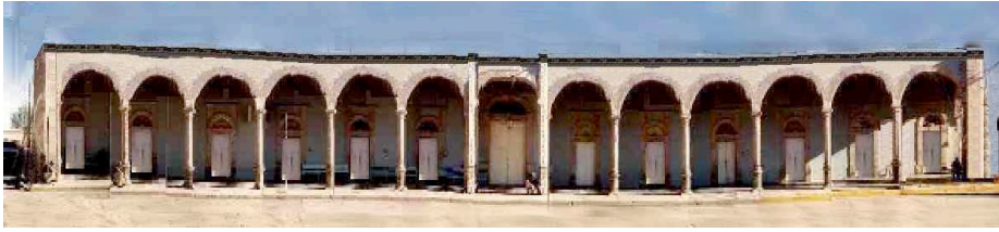
Figure 5. North (main) front of Consistorial House.