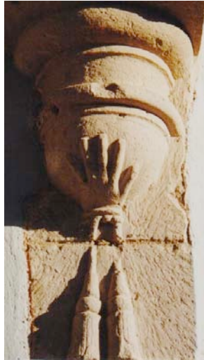
Figure 2. Hand on bracket in Consistorial House

meditation, and in there, a mute language in concordance with the diverse divisions framed in them, is generally enclosed (RODRIGUEZ, 1995)