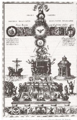
Figure 1. Allegory of the establishment of the Church in the New World by D. Valadéz 1579

We speak then, about the art of memory through the mnemonic symbols but also through an art of oblivion , as we can infer this is frankly a social manipulation by means of symbols.