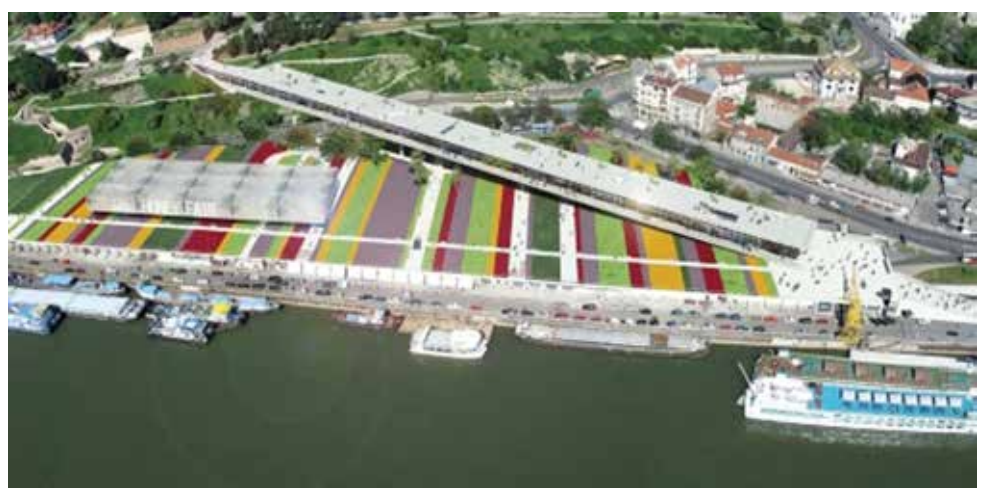
Fig. 7: The winning project for Beton Hala international competition done by arch. Redžić.

In 2011, the City of Belgrade launched an international one-stage architectural competition to design the Beton Hala Waterfront Center in Belgrade. The Waterfront Center is envisioned as the principal new access point from the capital's riverfront to its historic core, and a contemporary architectural anchor point for a vibrant pedestrian zone in one of the city's oldest continually inhabited parts. Two projects shared the first prize: The first one was done by local architectural team from Belgrade - atelier Redžić. It offers a simple, but refined complexity. Viewed from Novi Beograd and from the bridge, new spaces underline the skyline of historic Kalemegdan, without competing with its silhouette (Figure 7). Colourful, flowery treatment of the roof enriches the view to the fifth facade, and two functional volumes with high level of flexibility constitute architectural body of the project.