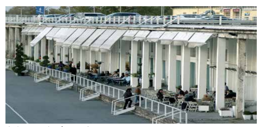
Fig. 6: Regeneration of Beton Hala

ignored. It is planned as an urban cultural park that hosts international and local exhibitions and events. The architecture is a mix of industrial heritage, integrated within a green landscape against the historic backdrop of the Belgrade Fortress (Figure 6).