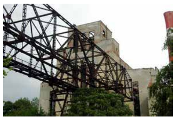
Fig. 4: Old Crane at Marina Dorćol.

objects, nautical center, yacht club, reception, hangar, workshop, etc. "Stari Kran" (old crane) is located on this site. It is an example of industrial architecture from the beginning of the 20th century (Figure 4). It was the crane built in 1932 and belonged to an electrical plant "Power and light", and it was protected by state as national heritage<sup>43</sup>. During the 2000 it was an international architectural and urban design competition for regeneration of old marina. The winning project incorporates the old crane as a part of the design solution. The final project also followed these guidelines (Figure 5).