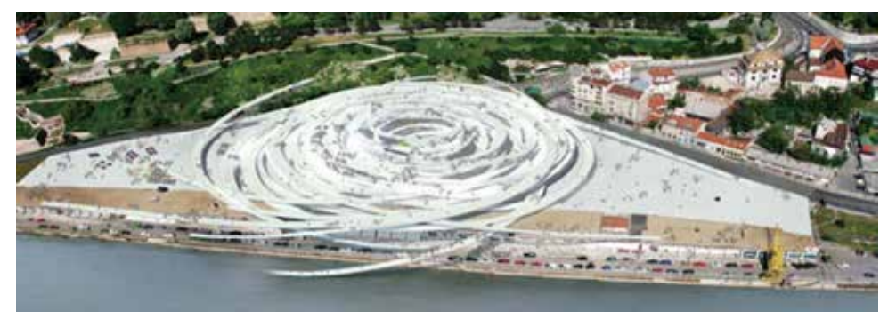
Fig. 8: The winning project – first shared prize – for Beton Hala done by arch. Fujimoto.

Another successful example of regeneration of industrial zone along a riverfront is artistic district SOHO BG, which was given to international affirmed artists. Adaptive re-use of former "Srbijatex" building has been done in 2010. The quarter was inspired by SoHo districts in London and New York and has potentials to grow into the most exclusive city parts, rich in cultural and artistic contents.