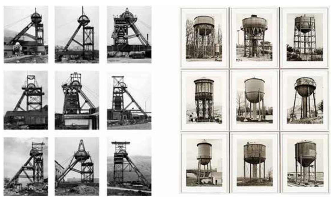
Fig. 1: Aesthetic potential of transient industrial structures: Typology of winding towers – left, Typology of water tanks – right. Source left: Becher, B., & Becher, H.(1980). Water towers, Retrieved January 19, 2011, from http://collectingseminar.wordpress.com/2008/11/03/bernd-and-hilla-becher-collected-industrial-age-calvinist-holy-sites-nick-wylie/berndandhillabecher01/). Source right: Becher, B., & Becher, H.(1967-96). Winding towers, Retrieved January 19, 2011, from http://www.moma.org/collection/browse_results.php?criteria=0%3AAD%3AE%3A8095|A%3AAR%3AE%3A1&page_number=4&template_id=1&sort_order=1.)

Lack of understanding of the multitude tangible and intangible values that abandoned industrial sites possess and messages they carry leads to their decline and complete disappearance, resulting in distortion of collective identity, based on the industrial past of community, and personal identity of citizens in terms of a sense of belonging to a community.