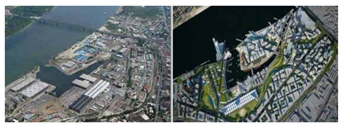
Fig. 2: Present situation of Danube's waterfront and Liebeskind's project for future development.

have become a new leitmotif, a symbol and a sign of anticipated progress, which often ignores usual planning procedures in order to produce a glamorous image typically created by star-architects. One of the megaprojects for urban regeneration of Belgrade's waterfronts is a Master plan for Port Belgrade. It covers the industrial zone along the Danube's riverfront, which was a key element of urban identity during the end of the 19th and the beginning of the 20th century. The projects related to the left bank of Danube (Marina Dorćol and the Port Belgrade) tend to close down industrial facilities and introduce housing and commercial activities (Figure 2). The main aim of the Port Belgrade project is to activate the great potential of the riverbank and to build a modern urban center as an integral part of the city which will improve the appearance and importance of the location and the entire Belgrade. Variety of districts is one of the objectives of the Master plan. Each district is special depending on its purpose, character and particular identity and has been designed in line with the mixed-use principle.