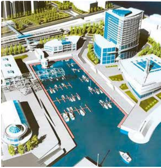
Fig. 5: Wining project at International competition which incorporate the existing Old Crane.

Due to their strategic importance for the further development of Belgrade, both sites have been in the public eye for several decades which resulted in a number of plans, projects, national and international competitions, studies and workshops. However, the thorough analyses and evaluations, as well as the created visions and documents, have not been implemented, keeping the ambitious images of foreseen megaprojects in a domain of paper-architecture<sup>44</sup>.