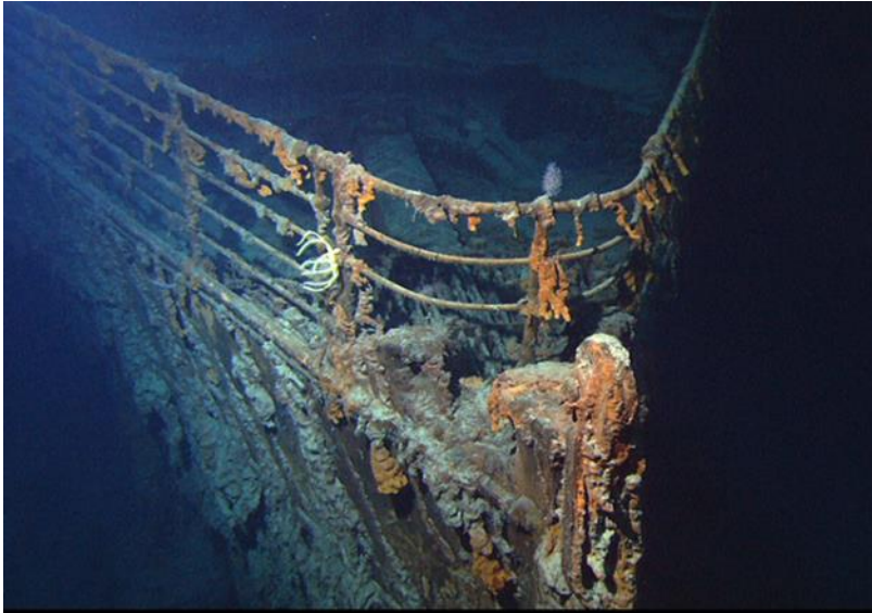
Bow of the RMS Titanic, photographed in June 2004, NOAA Photo Library.