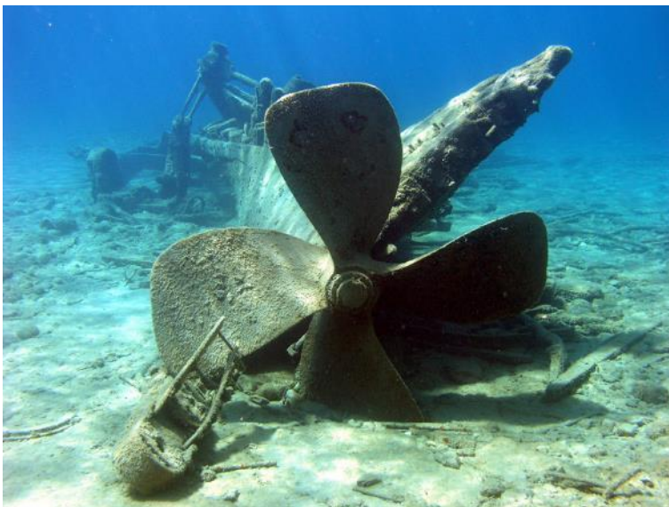
Thunder Bay National Marine Sanctuary, NOAA.

In 1972, President Richard Nixon signed the National Marine Sanctuaries Act (NMSA), authorizing the designation and protection of areas in the marine environment. The laws specifically called for protection of areas possessing significant “conservation, recreational, ecological, historical, scientific, educational, cultural, archaeological, or esthetic qualities.” The law grants the U.S. authority to protect natural and cultural resources on the OCS and within the 200-mile EEZ. Authority is delegated to the National Oceanographic and Atmospheric Administration (NOAA) to regulate activities, issue permits, assess civil penalties, and conduct enforcement to protect resources. The NMSA prohibits removing or injuring historic resources within the sanctuary, and any alteration of the seabed. The NMSA may be enforced against US-flagged vessels and nationals or against foreign-flagged vessels and nationals with their consent. However, in the case of seabed alteration, the law may be enforced against foreign vessels and nationals without their consent. The NMSA appears to be entirely consistent with customary international law as incorporated in the LOSC. 10