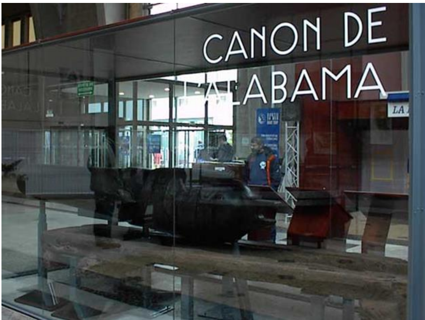
One of the canons from the CSS Alabama on display at La Cite De La Mer, CSS Alabama 2005 Project Photo Album, n.d. Web 19 Oct 2017, www.superiortrips.com .