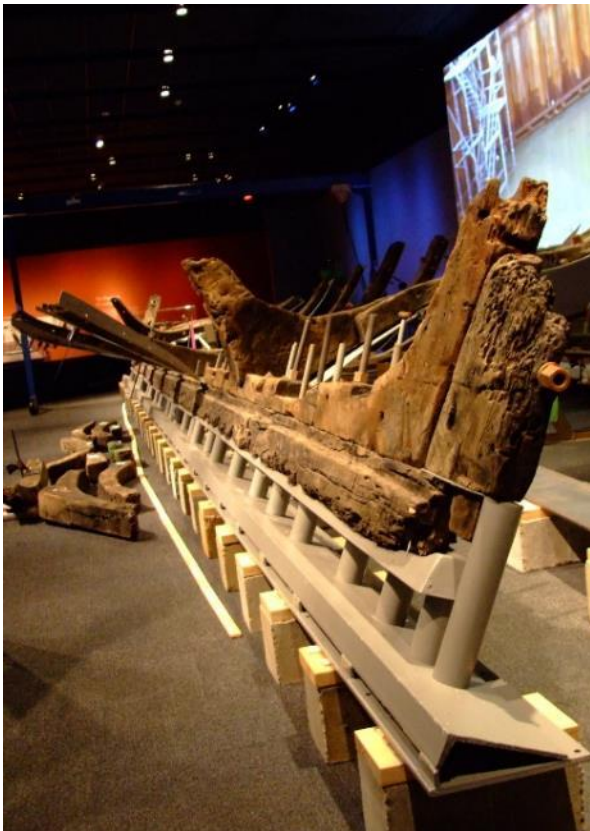
View from the stern of the hull of La Belle undergoing reassembly in Austin, December 2014, Yamplos, distributed under a CC BY-SA 4.0 license.

The U.S. has also entered into agreements with France to manage and protect the sunken warships CSS Alabama and La Belle , and with Japan on the Kohyoteki midget submarines. 5 These agreements recognized the ownership and sovereign immunity of the respective sunken warships and, more generally, that coastal states hold jurisdiction and authority over foreign sunken warships located within their territorial seas.