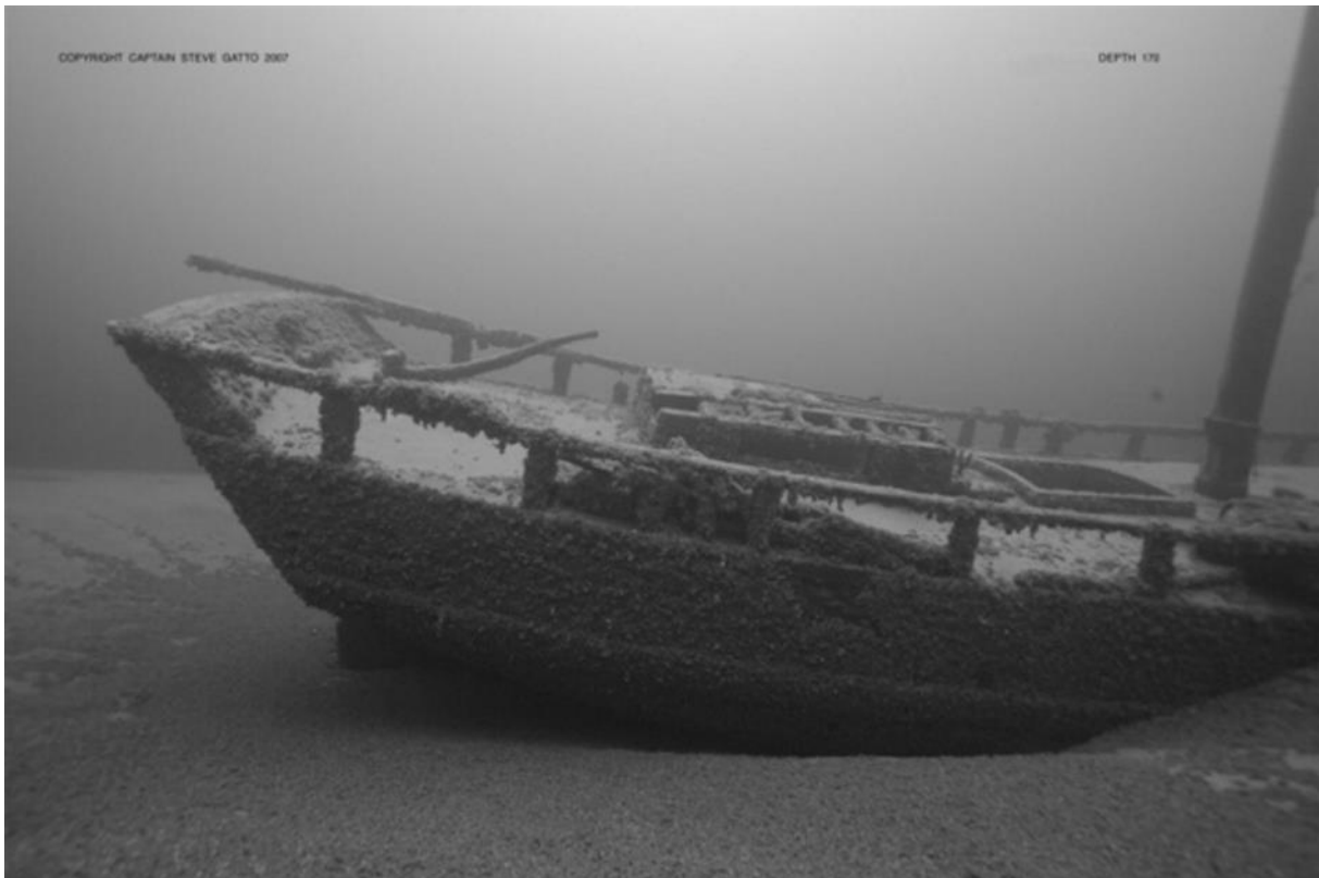
The shipwreck known as the "Dunkirk Schooner" found on the bottom of Lake Erie.