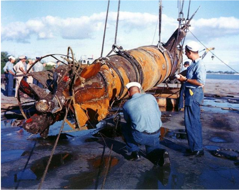
Japanese Type A midget submarine recovered in 1960 off Pearl Harbor, HI