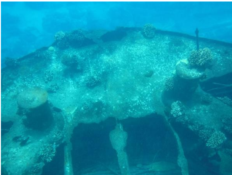
One of the Wake Island shipwrecks just outside the channel to the marina.

The Antiquities Act, passed by the United States Congress and signed into law by President Theodore Roosevelt in 1906, gives the President authority to proclaim national monuments on lands owned or controlled by the United States and to protect “historic landmarks, historic and prehistoric structures, and other objects of historic or scientific interest.” 6 While most monuments are on land, there are several marine national monuments managed by the National Oceanographic and Atmospheric Administration (NOAA). 7 The most notable marine national monuments include the Marianas Trench, Papahānaumokuākea, and Northeast Canyons and Seamounts. Beyond designation, research and recovery of antiquities on such lands requires permits. The Antiquities Act, has been used to protect cultural property in a marine environment managed by the U.S. National Park Service, the Canaveral National Seashore. 8 Yet, while designating marine national monuments to protect natural and cultural heritage within the EEZ/OCS is clearly within the U.S. government’s authority, it is unclear whether and to what extent the U.S. will use its authority to enforce the permit process on lands outside designated Marine National Monuments.