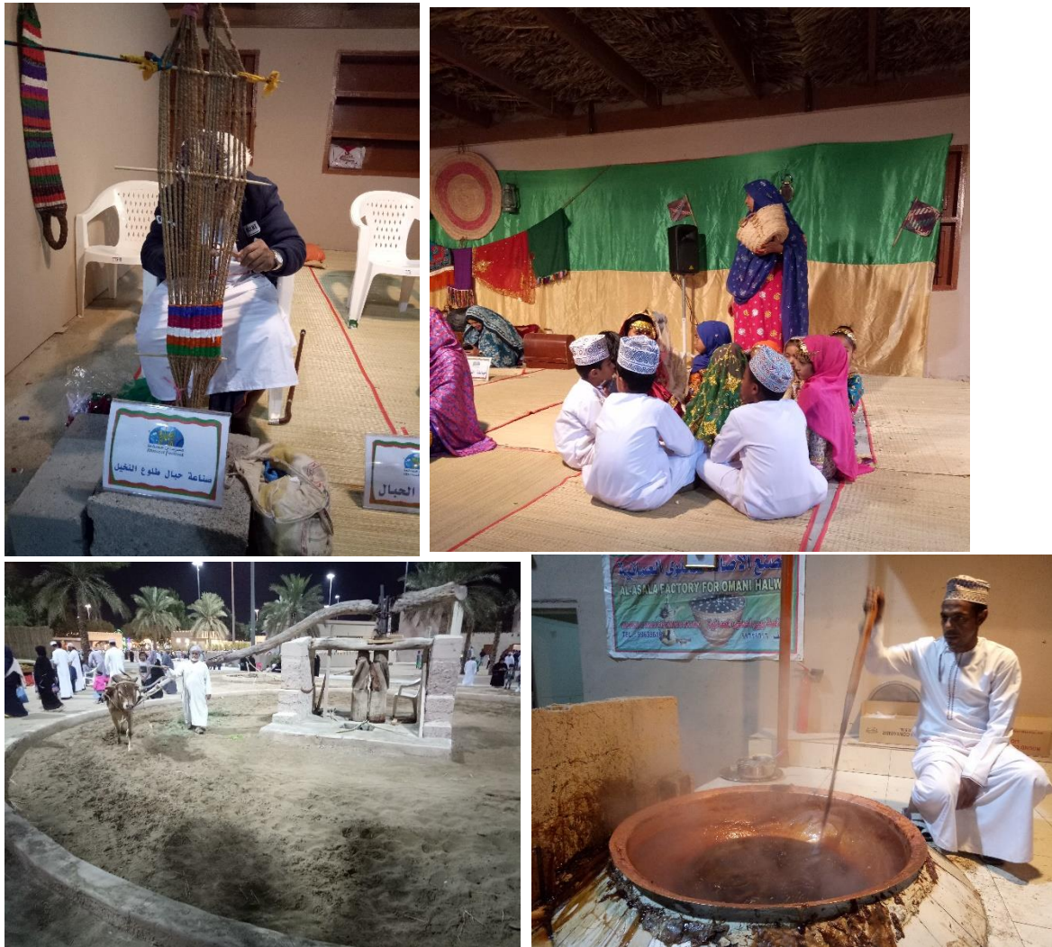
Figure 11 (B) Muscat Festival 2019 at al-Amarat Park