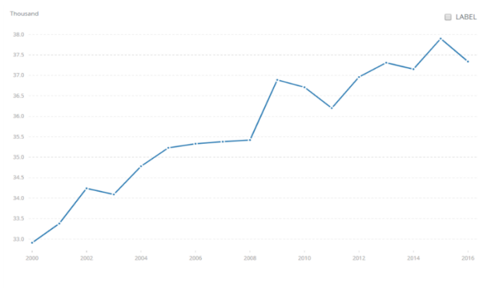
Figure 2 Agricultural land in Egypt (2000 – 2016)

Research aims at re-operationalizing the interaction process, which has been acted between the human being and the surrounding rural spaces, creating a significant emotional rapport with the cultural meaning and continually reviving the memories of the rural community and their cultural identity. This cultural identity contributes creating the Egypt's public image which subsequently, to highlight the transmitted traditional cultural features. Respectively, from the perspective of curating the rural villages and managing the sustainable heritage tourism, the heritage preserver could easily create 'a mental map' delivering the memorable spaces and its experience; and "allowing the [rural heritage village]'s public image to emerge through social curation" (Caballero, 2017, pp. 6, 7; Cranshaw, Luther, Kelley, & Sadeh, 2014, p. 3249).