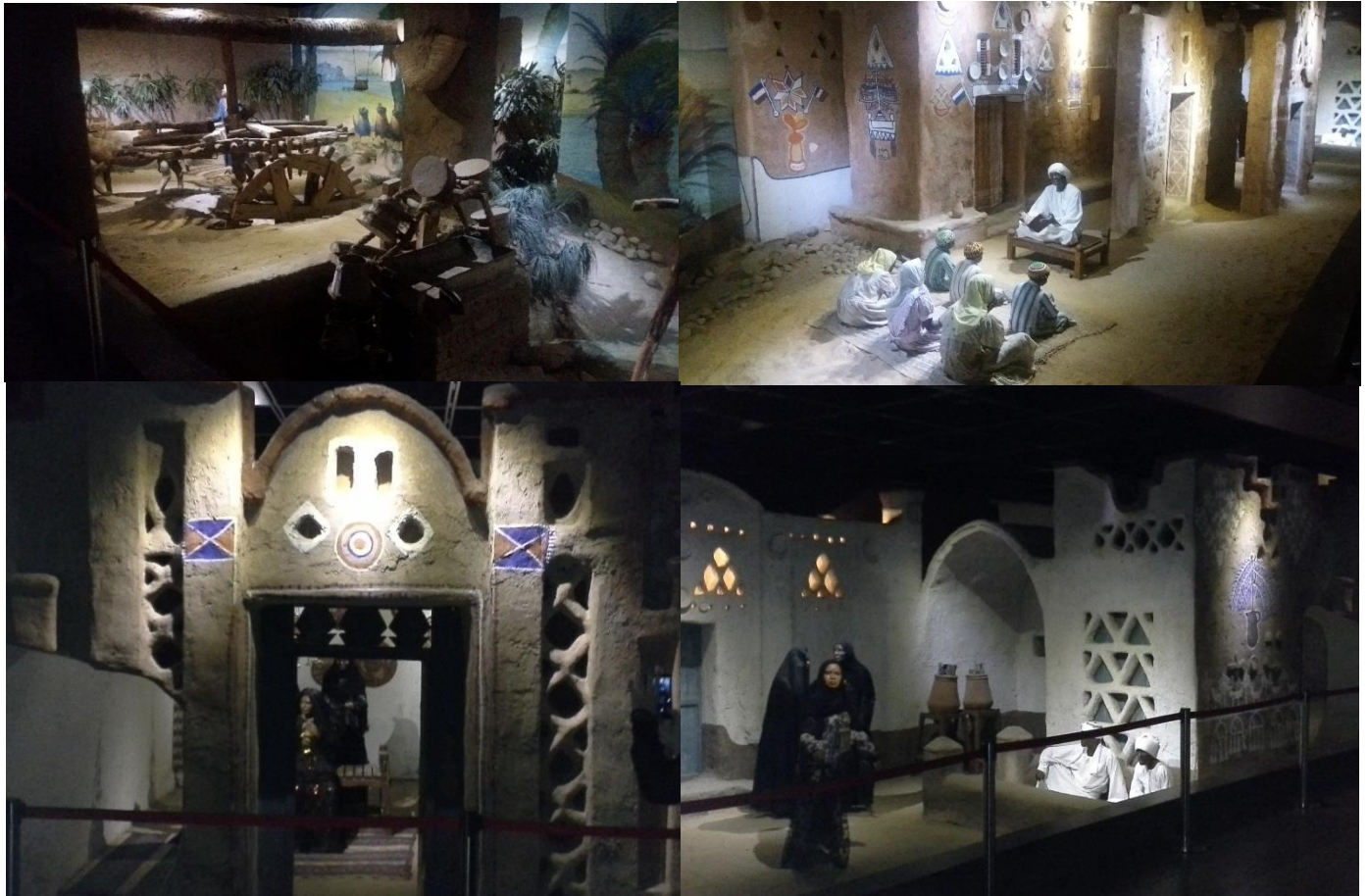
Figure 8 Ethnographic Heritage Exhibition, Nubian Museum, Aswan

Heritage Exhibition “Traditional Nubian Life”, Nubian Museum in Aswan. The exhibition is considered one of the significant cases worldwide that highlighting the major of Nubian cultural ethnological manifestations. It focuses on the themes that probably changed in particular due to the globalization effects. The designer wants to activate, using the interactive thinking, the local cultural memory for instance with the theme of traditional cultivation and irrigation methods, the scene of Kutab (to learn Quran), the features of the Nubian constructions' facades, the manifestations of preparing the bride to her wedding party and so on.