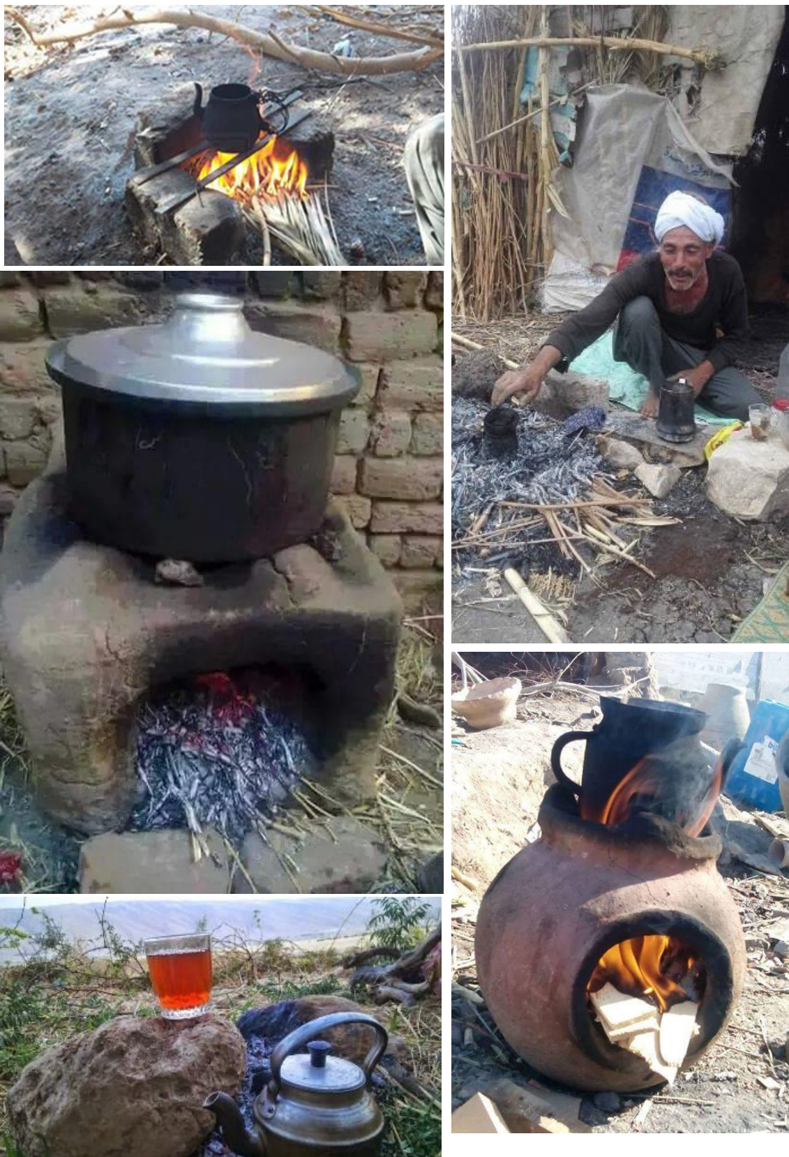
Figure 13 "el-Canoon", the Common Quick Cooking Oven at Egyptian Upper and Lower Rural Communities