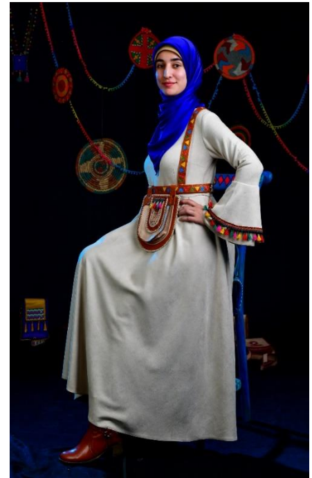
Figure 3 Dress "The Nubian Beauty"

Therefore, it has been recognized that the exhibition is generally developed not only to attract a high number of visitors but also to raise awareness of the museum's audience of a kind of issues at their society (Fouracre, 2015, p. 377). So, activating the visitor's thinking and emancipating the local community involvement, they can suggest a group of solutions and recommendations that to solve these issues or problems. Consequently, we can draw the characteristics of the heritage exhibitions that "are based on problem-solving and which draw on existing scientific and socio-historical knowledge and avoid sectarianism, while regarding a critical consciousness as an educational