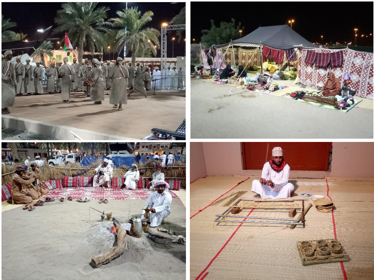
Figure 11 (A) Muscat Festival 2019 at al-Amarat Park

Valorizing this style of “Musealization”, researcher recommends creating various heritage fairs . Through these fairs, according to their geographical and demographical indicators, the rural community can display the manifestations of their cultural identity including their traditional customs, food, and habits. Therefore, we can open through these fairs a new channel of socio-cultural tourism in Egypt. Operationalizing this idea, the Egyptian tourism will be transformed from the mass tourism phase to the high value cultural tourism. Respectively, this kind of tourism opens various and numerous job opportunities for the youth generations in the rural areas; mitigate the local immigrations to the urban cities; as well as supports and enhances effectively the rural development projects. For instance of the heritage fairs, researcher already visits Muscat Festival 2019 at al-Amarat Park where was designed to host this great heritage fair. Although this fair doesn’t mainly focus on Omani rural heritage, he already finds out numerous manifestations of Omani traditional culture including the traditional dances and old musical instrument, traditional cuisines (e.g. Omani Halwa ) and clothes, traditional crafts and so on.