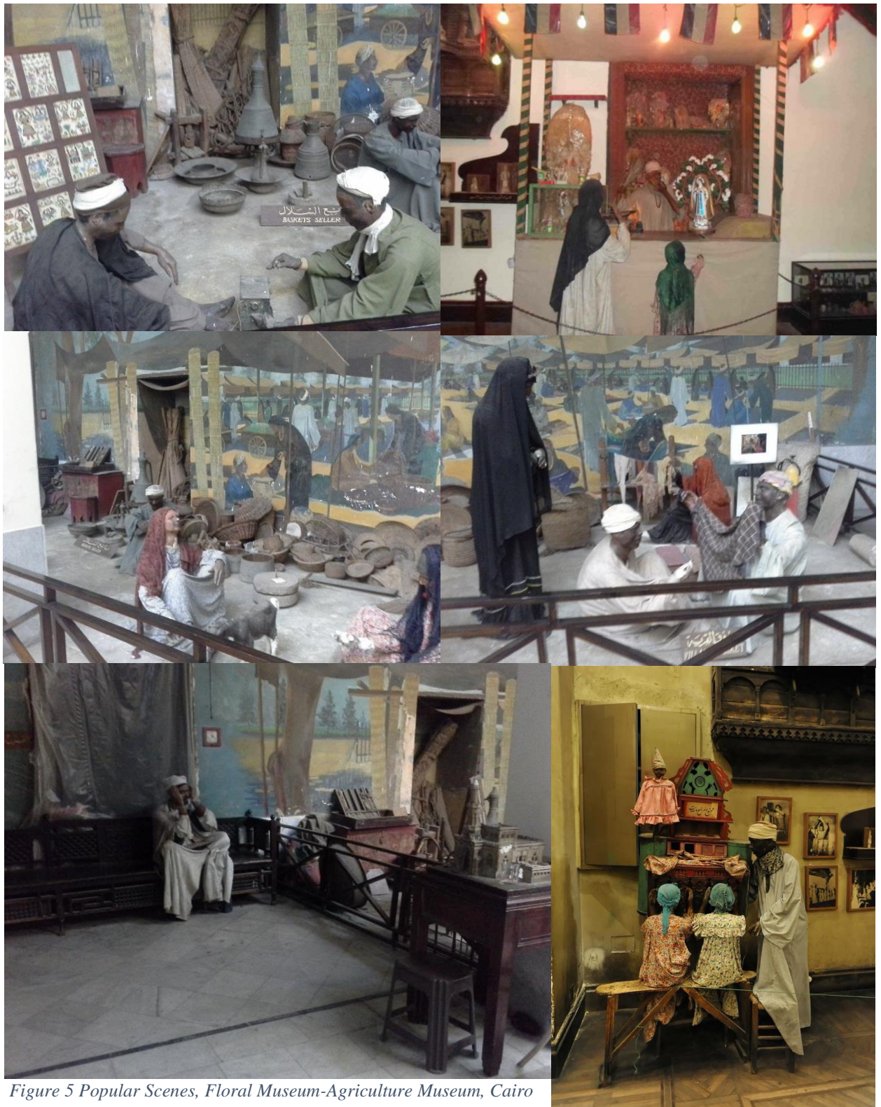
Figure 5 Popular Scenes, Floral Museum-Agriculture Museum, Cairo