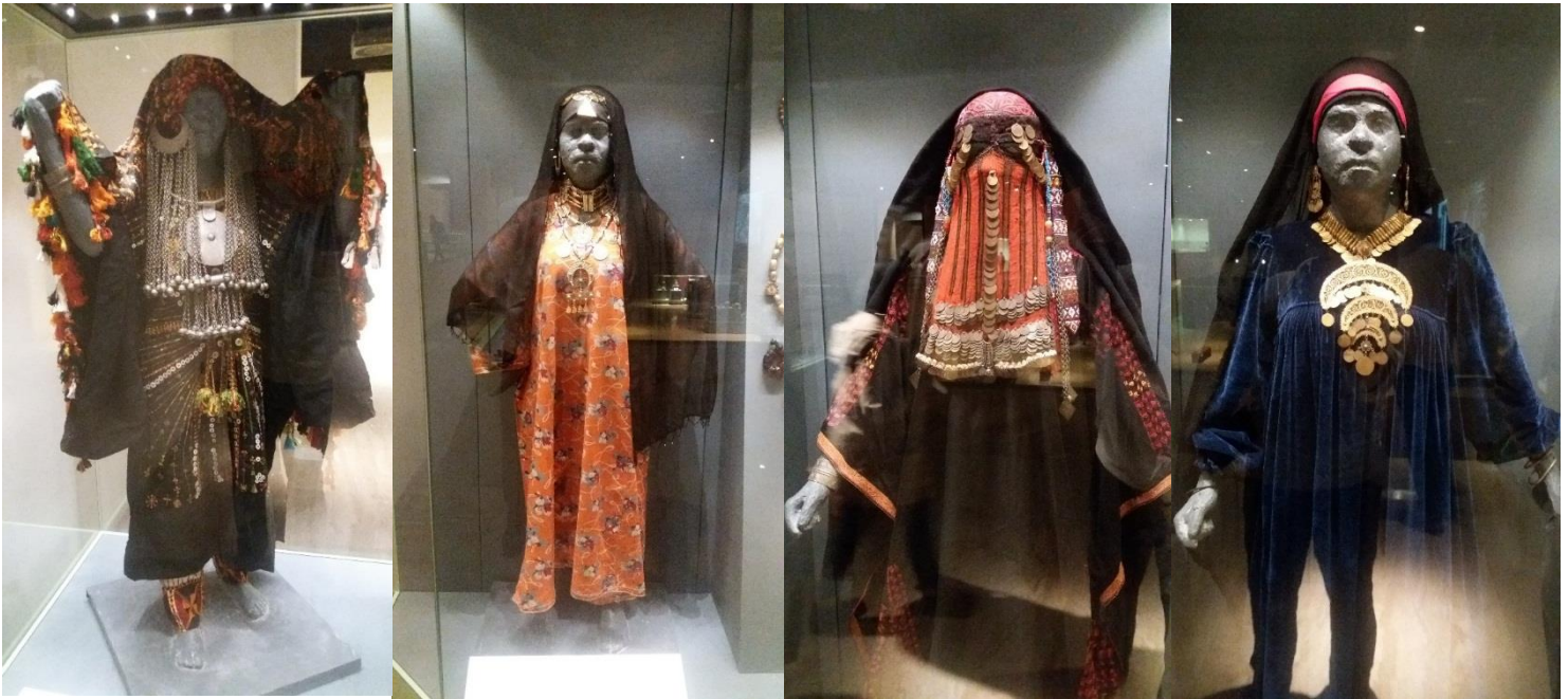
Figure 4 Part of the NMEC Temporary Exhibition refers to the traditional custom in Lower and Upper Egyptian Rural Communities, and Nubian and Siwan Community

National Museum of Egyptian Civilization (NMEC) in Cairo: In 2015, the designer of a NMEC temporary exhibition " Egyptian Crafts through the Ages " put in particular the manifestations of the isolated communities that the Egyptian citizens don't know more about their culture and their ICH, e.g. the oasis communities and the traditional Upper and Lower Egyptian rural communities.