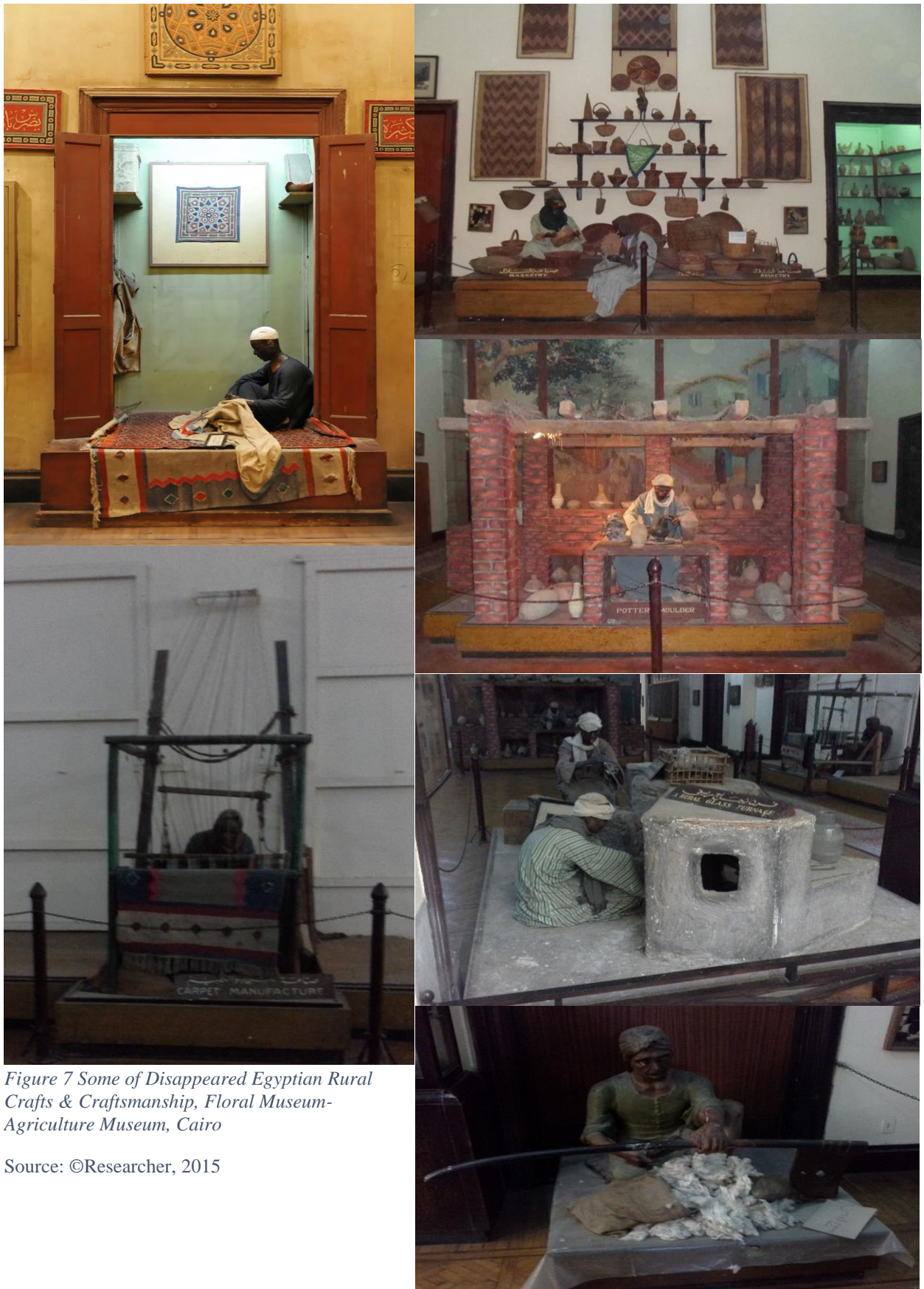
Figure 7 Some of Disappeared Egyptian Rural Crafts & Craftsmanship, Floral Museum-Agriculture Museum, Cairo