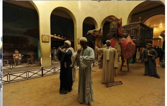
Figure 6 Wedding Party Rituals in Upper & Lower Egyptian Rural Communities