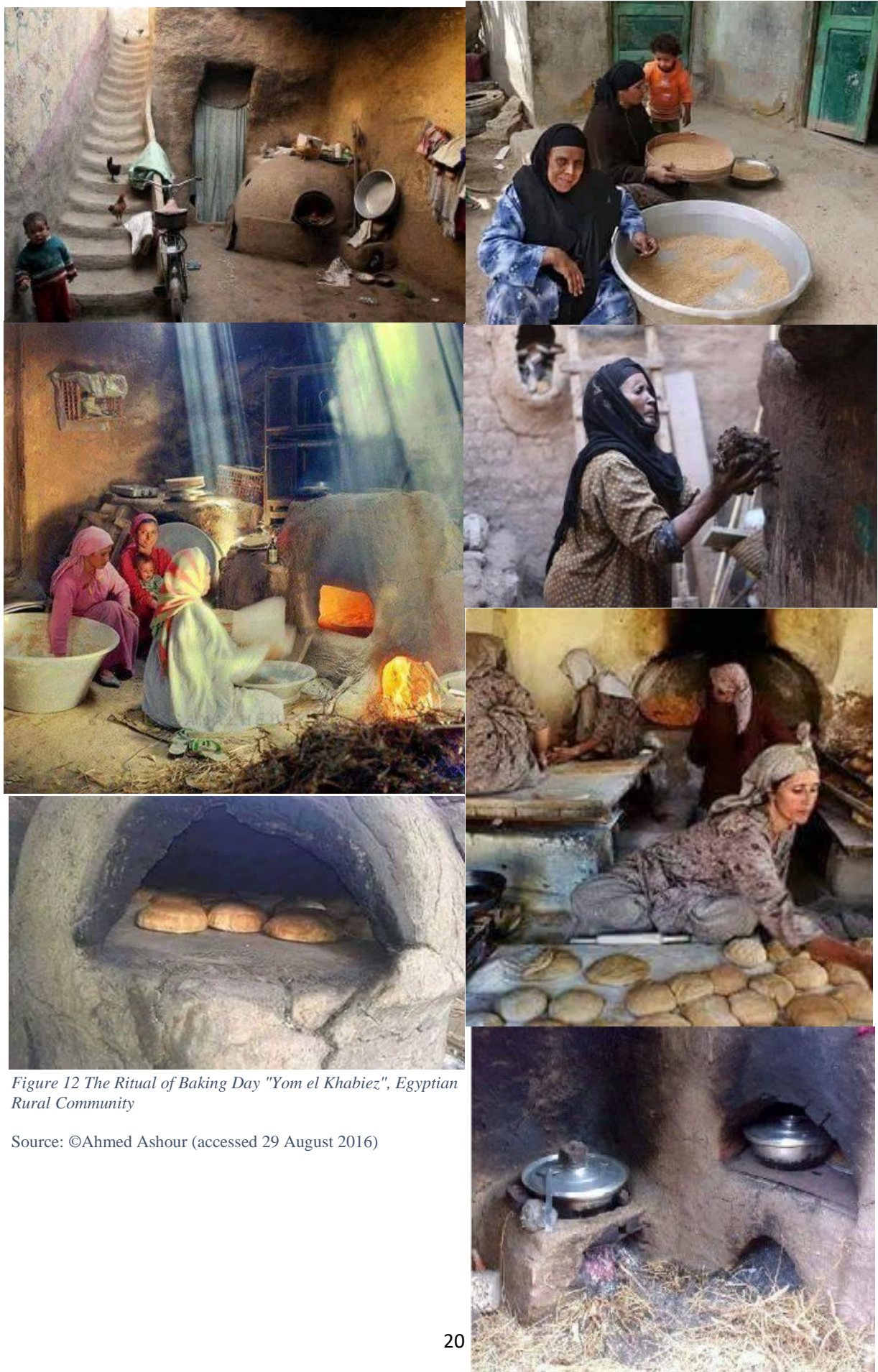
Figure 12 The Ritual of Baking Day "Yom el Khabiez", Egyptian Rural Community