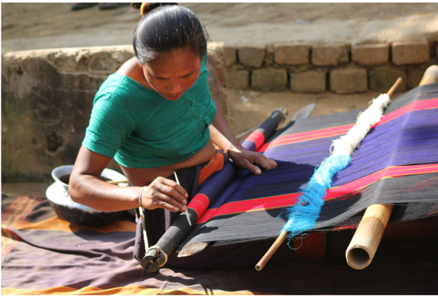
Fig. 1 A tribal (chakma) woman making her cloth.

whose traditions and “ethos” are not welcomed by host communities possibly “remain the mindset of exile, not citizens” (Scarre et al. 2019).