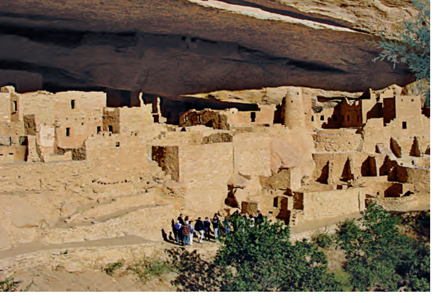
Participants in the 2004 Conservation of Decorated Surfaces on Earthen Architecture colloquium visiting Cliff Palace at Mesa Verde National Park in Colorado.

alumnus—sought to improve conditions for the conservation of immovable cultural heritage in sub-Saharan Africa by integrating it into a sustainable development process. It aimed to create better policies and legal frameworks for conservation, increase professional capacity, and improve communication among African institutions working in the field. The project stimulated the development of a cross-continent network and produced several publications and conference papers.<sup>19</sup> A similar Central Asian Earth initiative was led by CRAterre-ENSAG from 2002 to 2012.<sup>20</sup>