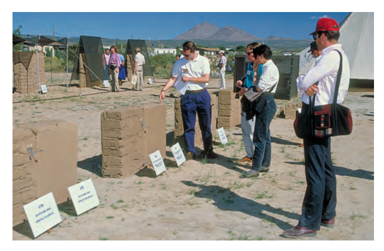
Participants at the 6th International Conference on the Conservation of Earthen Architecture, held in 1990 in Las Cruces, New Mexico, examining test panels. Known as Adobe 90, the conference marked the transition from relatively small, specialized meetings into truly international conferences, greatly expanding the number and geographic distribution of participants and papers.

In 1998 UNESCO created the chair on Earthen Architecture, Constructive Cultures, and Sustainable Development, a network of more than forty institutions (including universities, research centers, and NGOs) in Africa, the Americas, Asia, and Europe, and managed by the Architecture, Environment & Constructive Cultures Research Unit at ENSAG. The main objective of the UNESCO chair is to promote within the international community the development and dissemination of scientific and technical knowledge for the conservation of earthen architecture.<sup>13</sup>