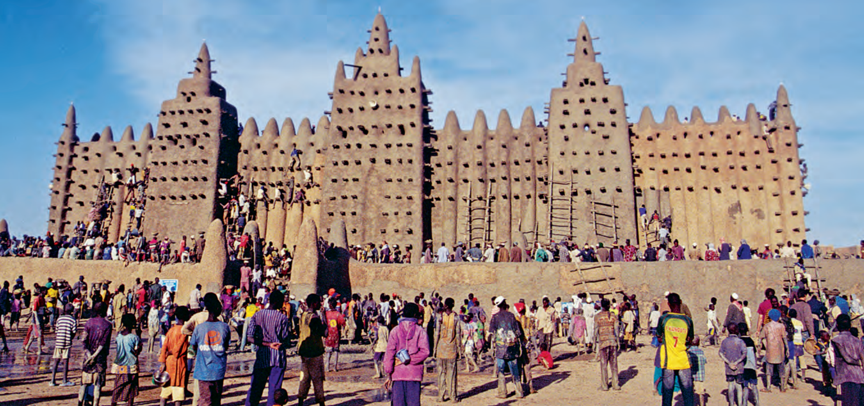
The annual community maintenance of the earthen Great Mosque of Djenné in Mali, in 2006.