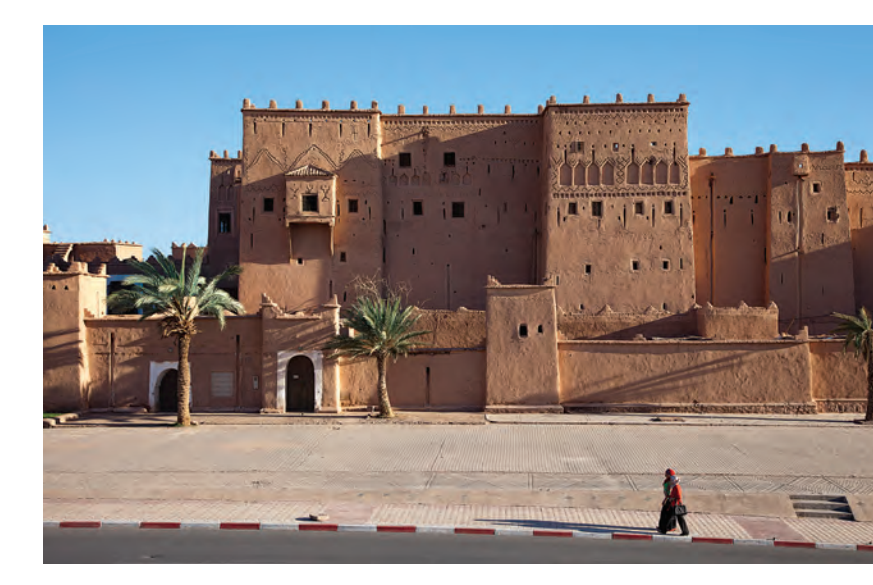
Kasbah Taourirt, headquarters of Centre de Conservation et de Réhabilitation du Patrimoine Architectural Atlasique et Subatlasique (CERKAS) in Morocco. CERKAS is a member of the UNESCO chair on Earthen Architecture, Constructive Cultures, and Sustainable Development—a worldwide network of more than forty institutions.