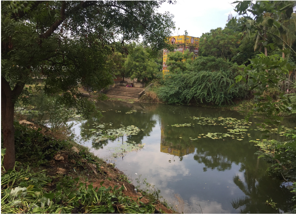
^ Fig. 4 Perungulam vaykaal (water channel) along the Thamirabarani river basin.

systems are integral to the conservation of the chinampas, as well as to what is hoped will be the recovery of more of the islands.