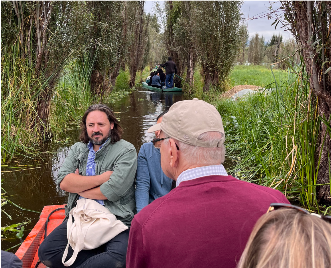
^ Fig. 2 Technical visit to chinampas of Xochimilco, Mexico City, Mexico (Source: Bretony Colville).