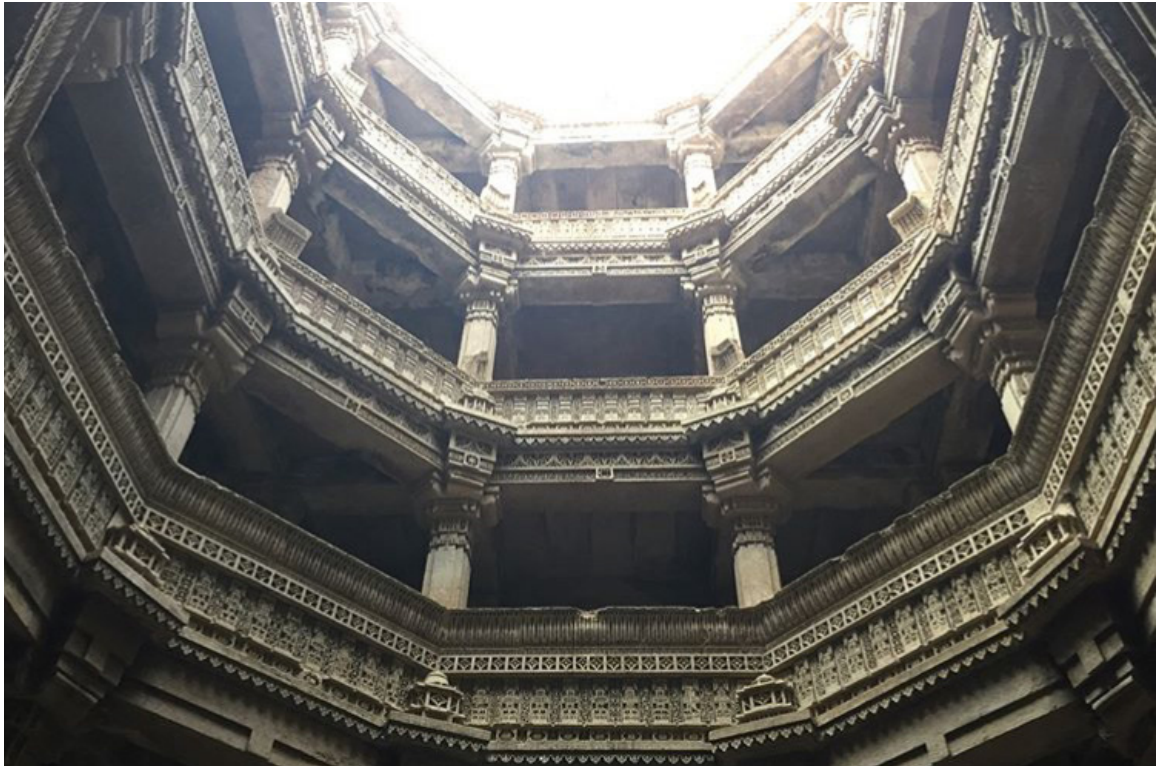
^ Fig. 6: Dada Harir ni Vav (stepwell) in Ahmedabad.

Subterranean Waterscapes of India,” presented and published as part of 2019 ICOMOS Water as Heritage international conference proceedings, reflected on the need for inclusivity and diversity in narratives of water history to encourage equity in gender representation and participation.