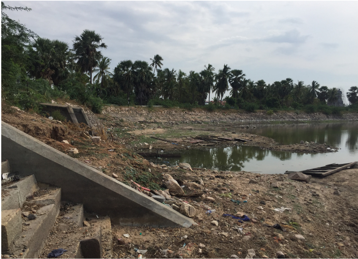
^ Fig. 5 Condition of the Perungulam Kulam (water storage) during the pre-monsoon months (Source: Saranya Dharshini).

on Cultural Landscape dialogue series, raised awareness about the lack of heritage protection and slow eradication of historic water bodies (Dharshini 2021).