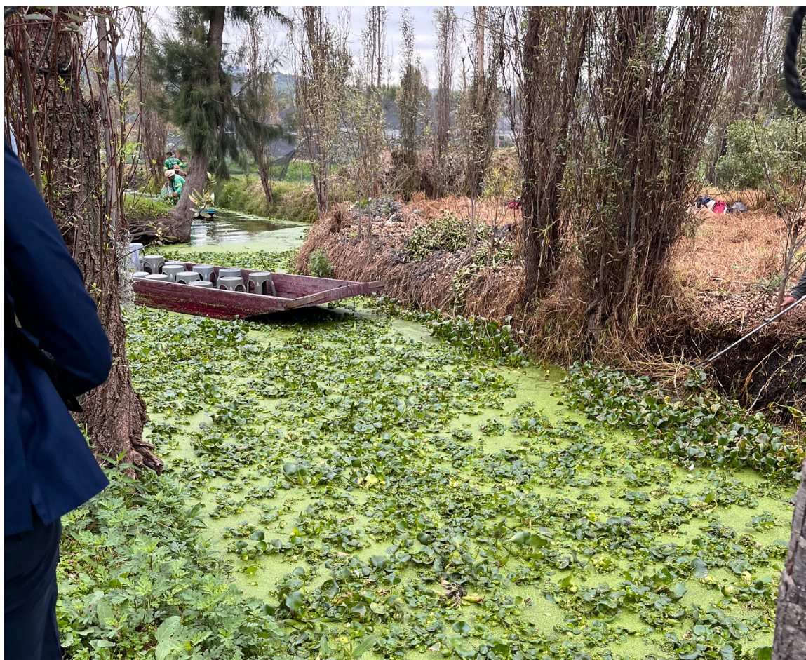
^ Fig. 3 Chinampas canals clogged with invasive waterlilies.

of water resulting in soil subsidence, invasion of introduced species, and harmful chemicals. These threats are common problems around the world, however, the chinamperos the traditional practitioners, are using a combination of traditional and modern techniques to combat them. The natural filtering system produced by the unique construction methods help maintain the quality of the water, while the introduced species are being controlled and used as green fertilizer. The lessons learned at this site could possibly be used to improve conditions at other locations, such as Ifugao in the Philippines,