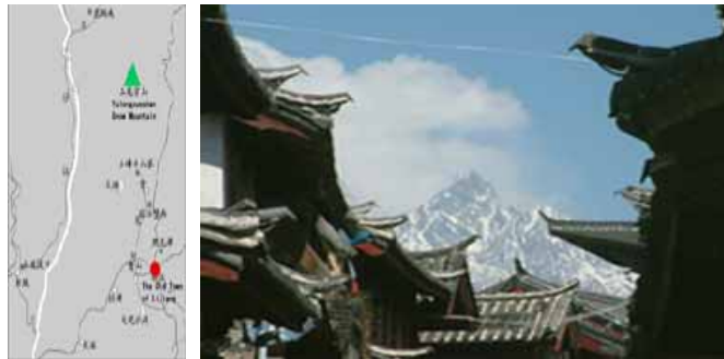
Figure1 The location and view of the old town of Lijiang and Yulongxueshan

Lecturer Department of Tourism Design ,Kyoto Saga University of Arts,Japan