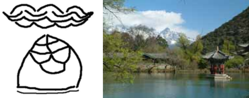
Figure2 Dongba character of Yulongxueshan and the view from Heilongtan