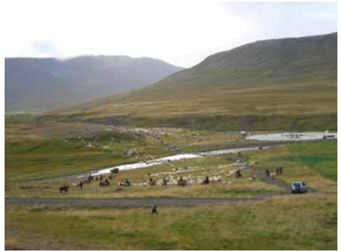
Fig.5 Characteristic landscape in Iceland during sheep roundup time .Both terrain vehicles and horses are used.