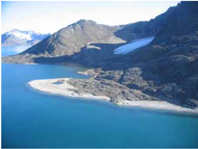
Fig.4 The trapping hut Bjornhamna in Svalbard is Situated beside the small lake on the large spit of land Centre picture .Despite its barren appearance, the area provided all that a wintering trapper needed to live and work in relative comfort.