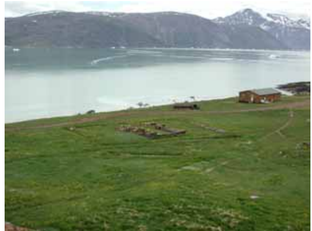
Fig.2 The Norse church ruins at Qassiarssuk /Brattahlid. A reconstructed Eskimo semi-subterranean dwelling to the right of the ruins, and a modern building far right. Paths for tourism between the various Norse ruins can be clearly seen.