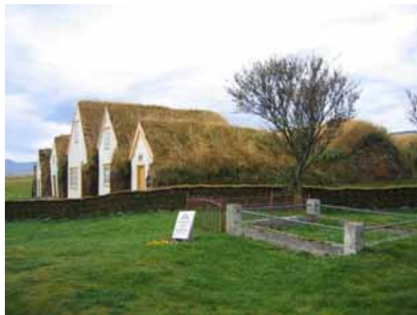
Fig.3 A well-preserved turf farm building in Iceland. The little available wood is used for the front gables and roof-supports, while the long walls and the roofing materials are sod which necessarily divides a large building into adjoined sections.