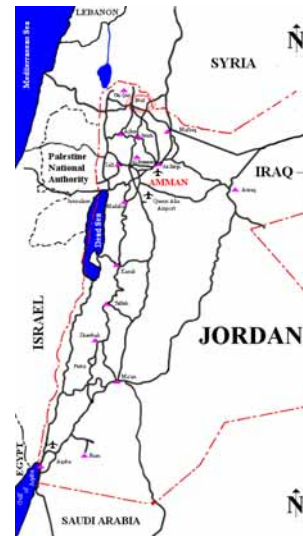
Fig.2 The principal routes of Jordan.