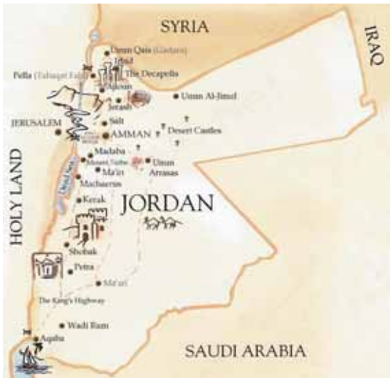
Fig.1 The map of Jordan.