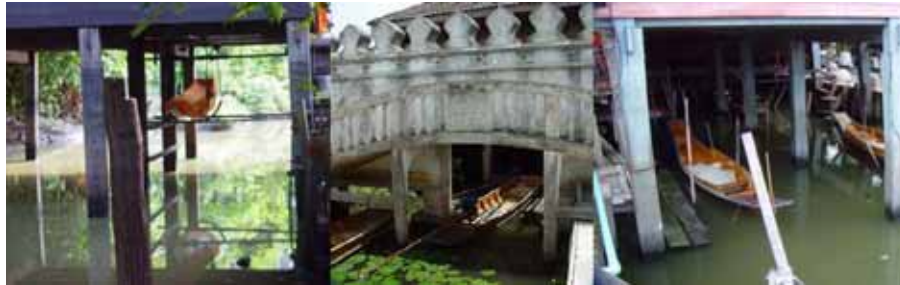
Fig 7. Several types of barge keeping dock for Binthabartrua