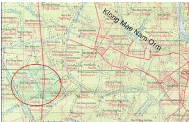
Fig 2. Site Map (Royal Thai survey department)