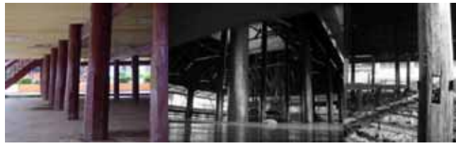
Fig 5. Salaganparean Wat Huakhu, Wat Somkling (right)