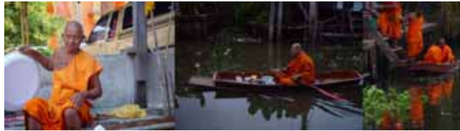
Fig 6. Binthabartrua