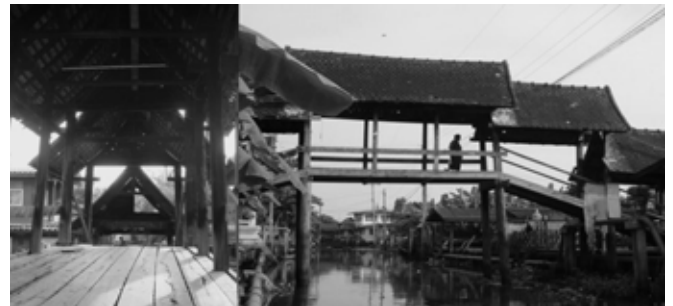
Fig 3. The bridge of Wat Somkliang