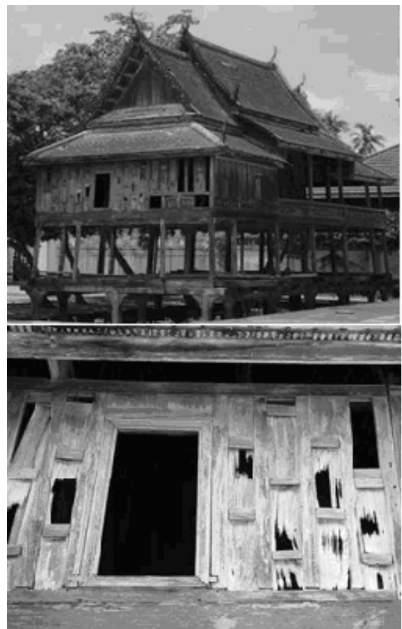
Fig 4. Hortri Wat Pra-ngam