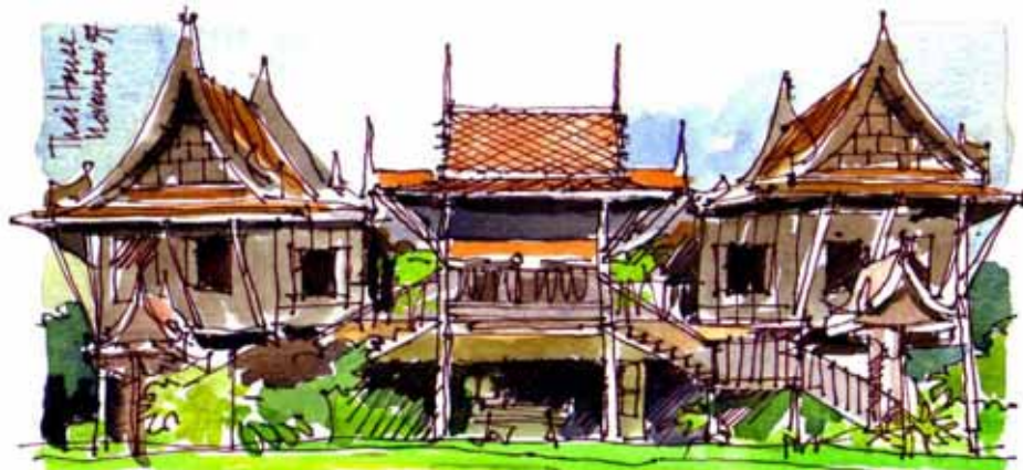
Fig 8. Thaihouse