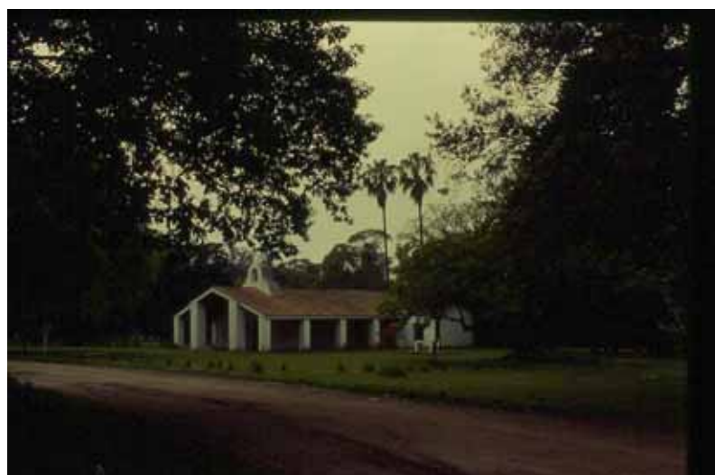
Figure 4: Cultural landscape: Pereyra Iraola Park.