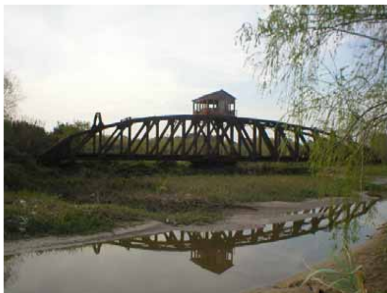
Figure 2: Industrial heritage. La Plata Port area.