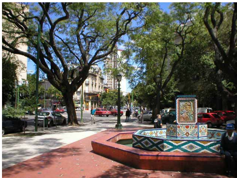
Figure 3. Historic town. La Plata.