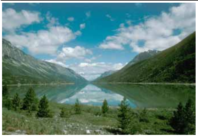
Fig.5 Lake Bennett - GM 1987