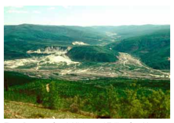
Fig. 3 Bonanza Creek Mining and Tailing, Guy Massson 1990