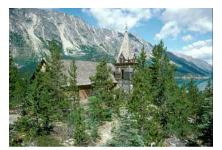
Fig. 7 St.Andrew`s Church 1900