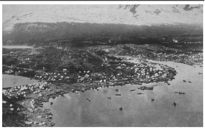
Fig.6 Tent City - Lake Bennett 1898