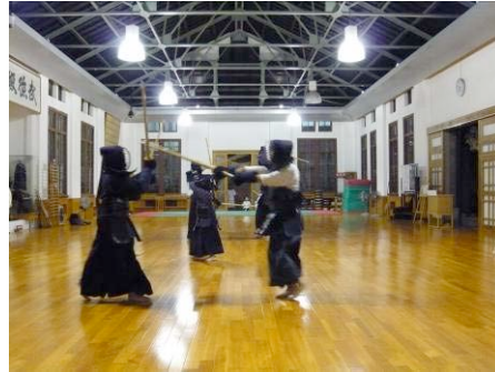
Figure 12. Kendo activity in Kaohsiung Budokuten