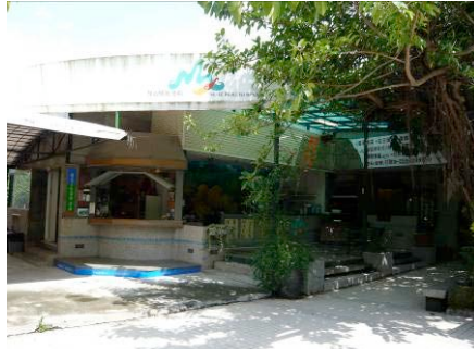
Figure 9. Restaurant at the front yard of Chishang Budokuten