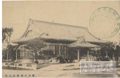
Figure 1. Taitoung Budokuten during Japanese colonial period.

space is spacious with wood floor to exercise traditional Japanese martial art. Figure 3; Figure 4.