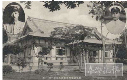
Figure 2. Changhua Budokuten during Japanese colonial period