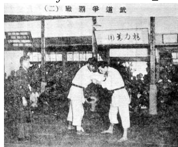
Figure 4. Exercise of Japanese martial art at Hualien Gang Budokuten during Japanese colonial period (available from Chen 1996_3-49)