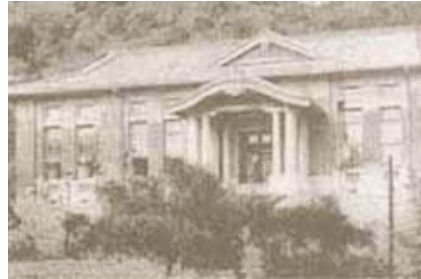
Figure 11. Kaohsiung Budokuten during Japanese colonial period (available from http://www.butokuten.twmail.org/001.htm )

Under this appropriate plan, Kaohsiung Budokuten would be an important site for promotion of the concept of cultural heritage conservation for local community, as well as the site for cultural tourism. Kaohsiung City Government also hoped the Japanese martial art would be displayed in this building to suit with this particular building. Meanwhile, Kaohsiung Budokuten, the lawful cultural heritage in Taiwan, should play an educational role for citizens. For this purpose, Budokuten would be a local Cultural Museum at Kaohsiung City. Some exhibitions and cultural shows would display in this building. Beside the jobs above, the manager should maintain this building (Kaohsiung City Hall 2005).