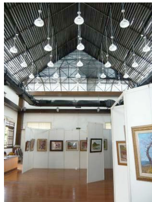
Figure 8. Interior space for exhibition in Chishang Budokuten after repair