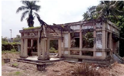
Figure 6. Chishang Budokuten after fire in 1994 (available from http://www.chi-san-chi.com/8archi/text/wudirden/index.html )

Chishang is a small town at Kaohsiung County in southern Taiwan. Recently Chishang Township Office made much effort to develop the tourism for this small town. They thought that the coffee shop would be an attractive place for the tourists, and it could service the local citizens as well. Therefore, the coffee shop seemed to be the best new function for Chishang Budokuten under this consideration.