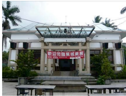
Figure 7. Chishang Budokuten after repair

However, this new function caused some debate. Some people, particularly the local elder citizens, think that coffee shop is not suited to Budokuten. They prefer Japanese martial art to be performed in this building. Beside the new function, the new roof with steel-frame and fiberglass is also denounced. In tropic Taiwan, this new roof causes high temperature for interior space and wastes much electric power for air conditioners in summer. High expenditure of the electric power often forced the custodian to close the shop in hot summer day. Under this predicament, the custodian and Chishang Township Office came to an agreement that restaurant was only set at the front yard of Chishang Budokuten. The interior space of Chishang Budokuten is for irregular exhibitions _Figure 8; Figure 9; Figure 10_.