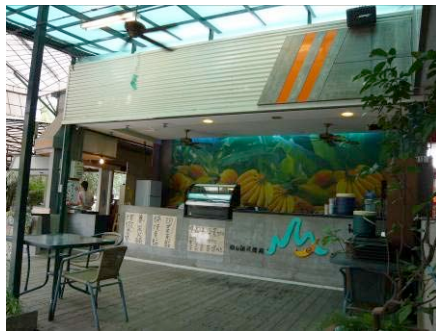
Figure 10. Restaurant counter at the front yard of Chishang Budokuten