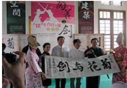
Figure 13. Kendo activity in Kaohsiung Budokuten