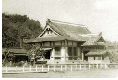
Figure 5. Chishang Budokuten during Japanese colonial period (available from http://www.chi-san-chi.com/8archi/text/wudirden/index.html )

Office decided to repair the construction of Chishang Budokuten and made a new plan to reuse _Figure 5; Figure 6_.