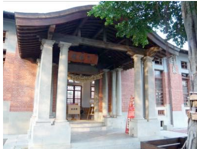
Figure 14. The situation of space which has no activity outside

always held in the building, and this association does not have any resource to support interpretation system for this building. The tourist who visits Kaohsiung Budokuten sometimes sees nothing in this building. Therefore, Kaohsiung Budokuten is not a famous tour site for tourists at Kaohsiung. Many citizens complain that they do not know such a good building which fills with the cultural and historic atmosphere. Even they go into this building; they can not gain good interpretation about the culture and history about this building. The tourists do nothing but just take look around the building when they visit this building in most of time_ Figure 14; Figure 15_.