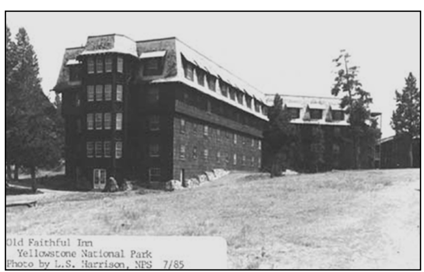
Old FaithfulInn. Yellowstone National Park