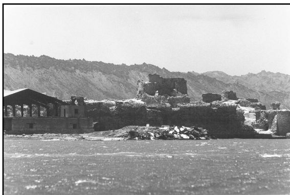
Fig. 1: Approach of Ormuz with the Fortress' present condition

Consultant for the Calouste Gulbenkian Foundation /Lisbon, having developed over 20 missions in countries of Europe, Africa, South America and Asia, and being author of several projects to the rehabilitation of patrimony of Portuguese origin outside Portugal. Consultant for the Historical Centre of the Town Hall of Oporto.