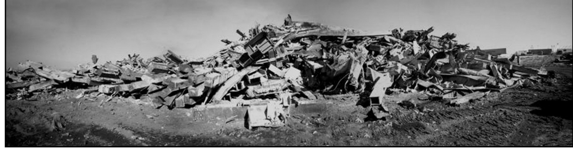
Steel from the World Trade Towers stacked for scrap at Fresh Kills Landfil (photo w (photo 2)