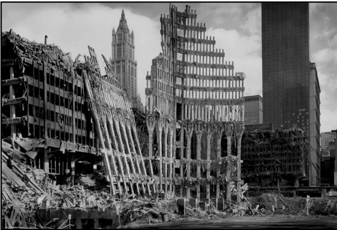
Ruins of North Tower Façade with the Woolwroth Building Constructed in 1913, behind.(photo 1)

older buildings can teach us the importance of what Cass Gilbert posted on his office wall – humility. Just when one is convinced that what we do now must be better than anything that preceded us, we often discover that our predecessors have been there before – and we discover that, with fewer materials at their disposal, they accomplished more. The thousands of pancake-collapsed buildings in recent earthquakes standing next to both ancient monuments and older vernacular buildings – all still standing – should provide reason enough to look more carefully at archaic structures, and to give them the same measure of respect that we give to the architecture they support. It should also motivate us to insist on conserving them as an integral part of the historic buildings that we work to save for our children.