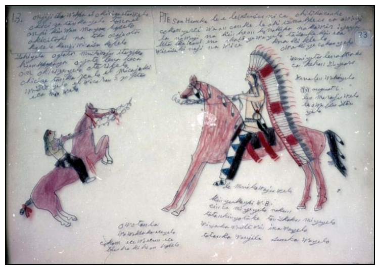
Figure 3. Drawing of Rosebud Battle by Joseph White Bull, Lakota. (White Bull 1931)

not always shared, nor understood by non-native agency personnel with little background in the history of these places.