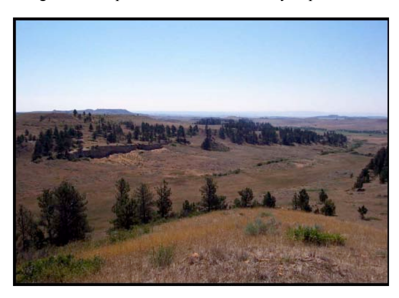
Figure 2. "The Gap" at Rosebud Battlefield. (Jenks 2007)

A study by the National Park Service and Western History Association (2002) under a Clash of Cultures theme identified a number of sites along the Great Sioux Wars trail deserving of far greater recognition and protection than is currently in place.